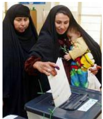
An Iraqi woman holds her child while voting at a polling station in the center of Az Zubayr, southern Iraq.

Election Day in Iraq was the culmination of vast amounts of work and planning by the Interim Iraqi Government. Once the people were freed to speak, once they were freed to establish their own government, the citizens of Iraq rose to the challenge. With great risk to themselves and their families, the people have championed their own desire to live free. The radical extremists have used bullets and bombs to try to convince them that they cannot succeed. Election officials were gunned down on the streets and in their homes, but when one fell, another stepped into his place.