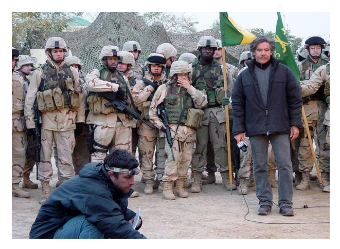
18th's Soldiers look at the monitor during a pause as election clips are broadcast.