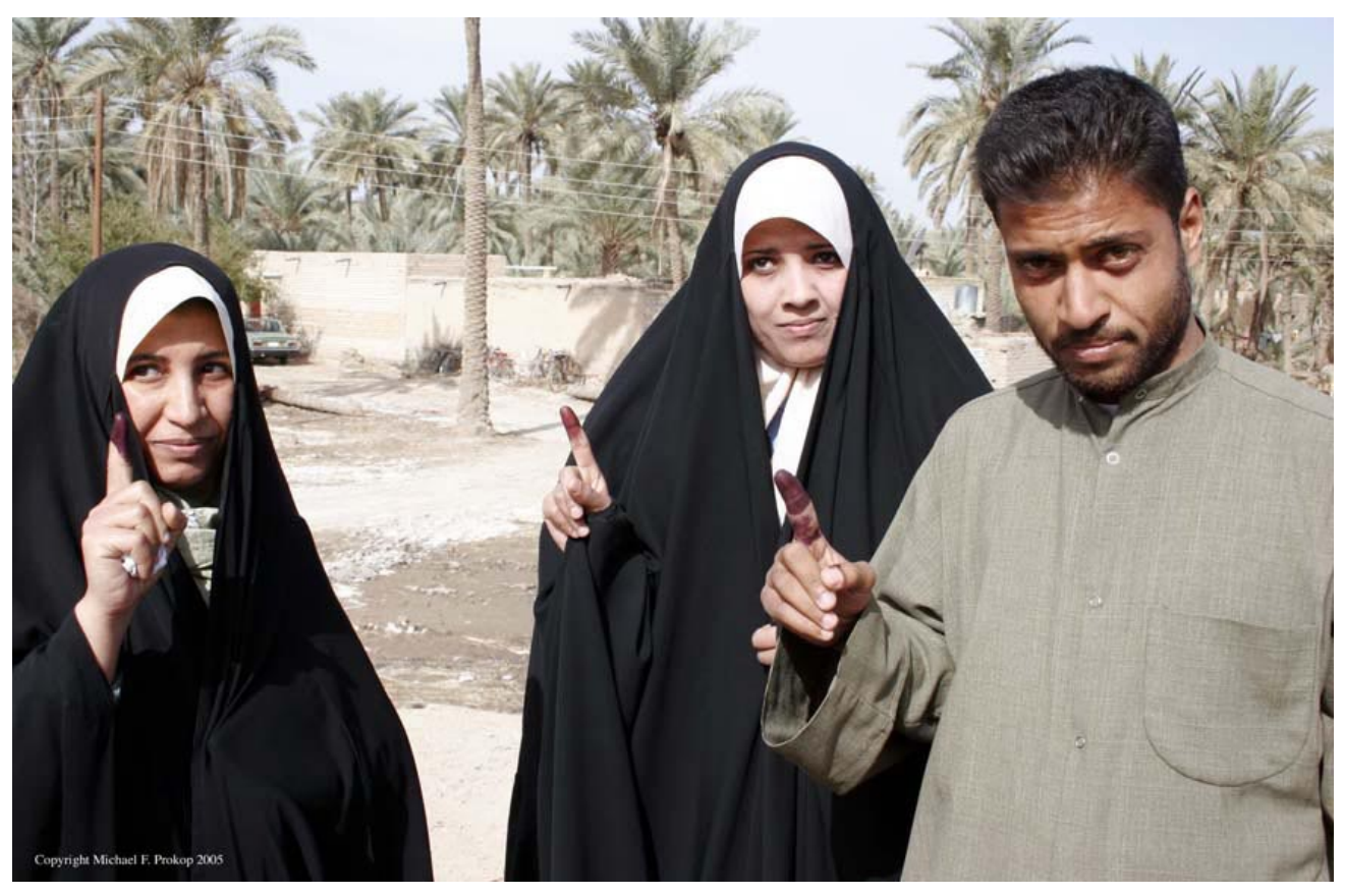
Three Iraqi nationals show their ink-stained fingers as proof of voting in Iraqs first democratic election. Soldiers of the 18th MP Brigade were conducting security operations at a polling station in Baghdad on January 30 during the election.