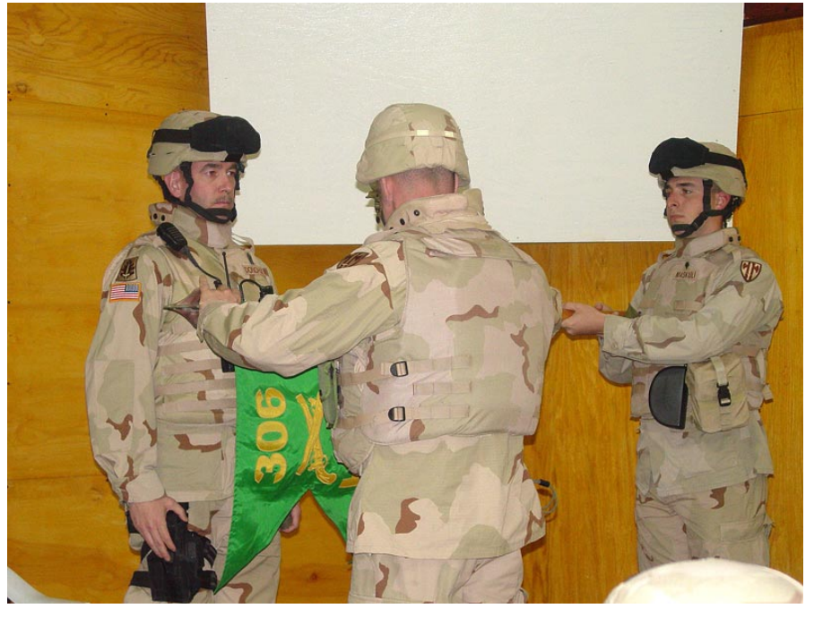
BAGHDAD, Iraq--The 306th Military Police Battalion unfurled their colors during a Transfer of Authority ceremony January 21 at the Abu Ghraib prison chapel. They replaced the 391st MP Battalion out of Columbus, Ohio who have been guardians of the prison since February 2004.