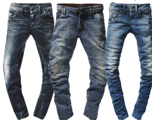
Saturday April 7, 2012