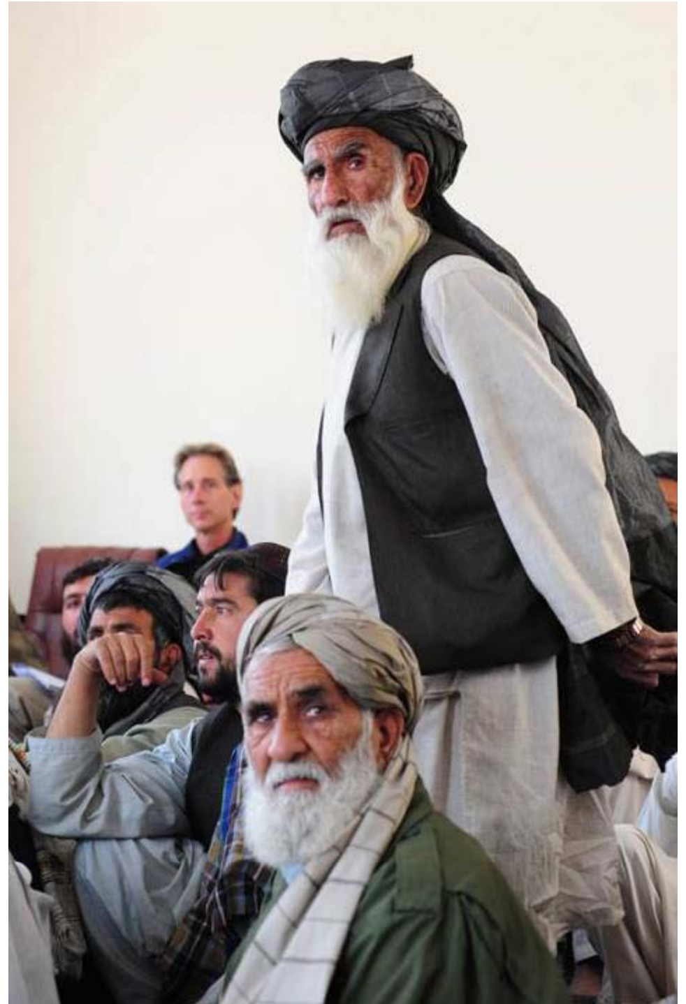
An Afghan elder speaks during a shura at the Joint District Community Center, Dec. 03, 2009. 091203-F-9891G-196