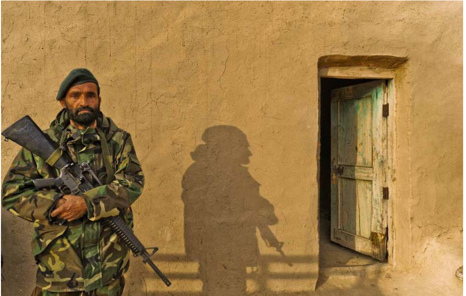
An Afghan National Army soldier provides security during a joint patrol in Shabila Kalan, Zabul Province, Afghanistan, Nov. 30, 2009. The Afghan National Army's mission is to safeguard the independence and territorial integrity of Afghanistan. 091130-F-9171L-092