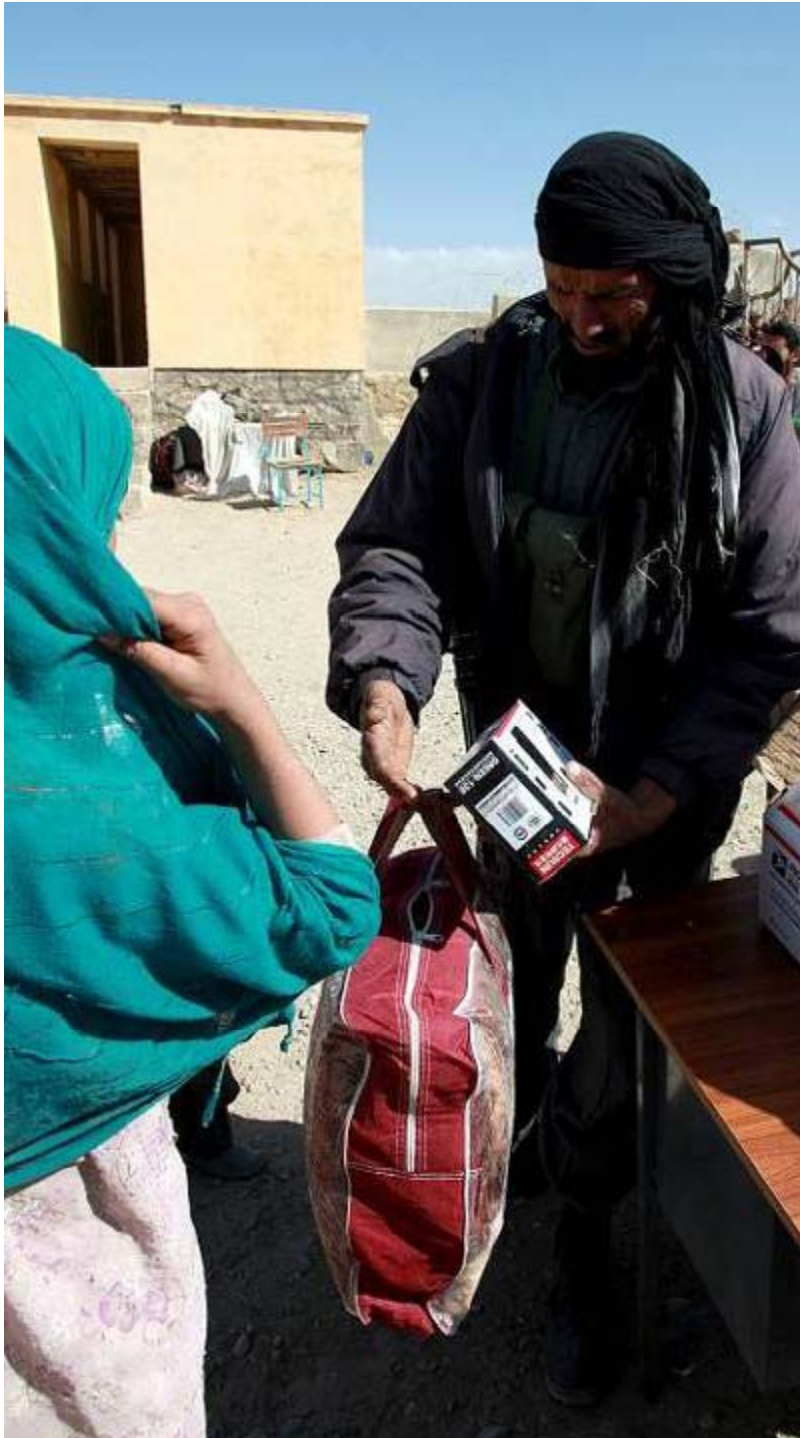
An Afghanistan National Policeman gives a radio and blankets to an Afghan woman in Logar Province, Afghanistan, October 22, 2009. The mission's objective was to provide humanitarian aid to the local populace. 091022-A-1748J-346