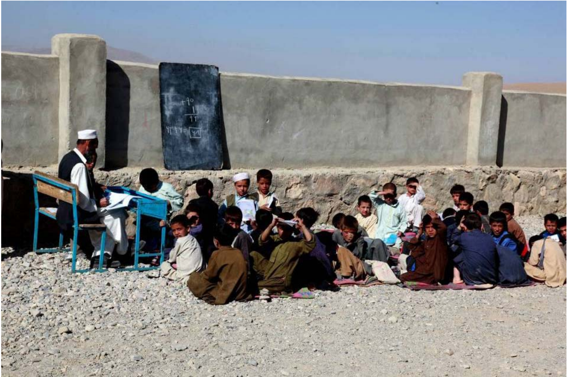
An Afghan instructor teaches students outside a schoolhouse in Logar Province, Afghanistan, October 22, 2009.