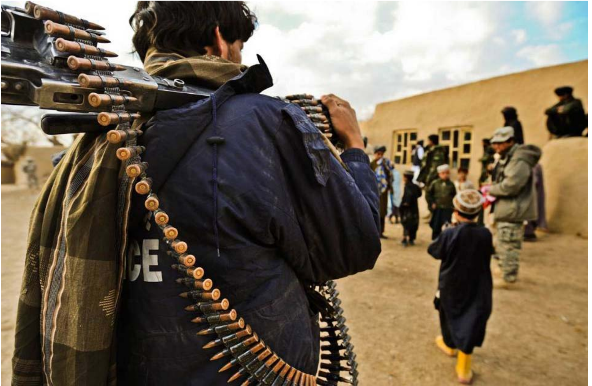
An Afghan National Policeman provides security during a joint patrol in Shabila Kalan, Zabul Province, Afghanistan, Nov. 30, 2009. 091130-F-9171L-107