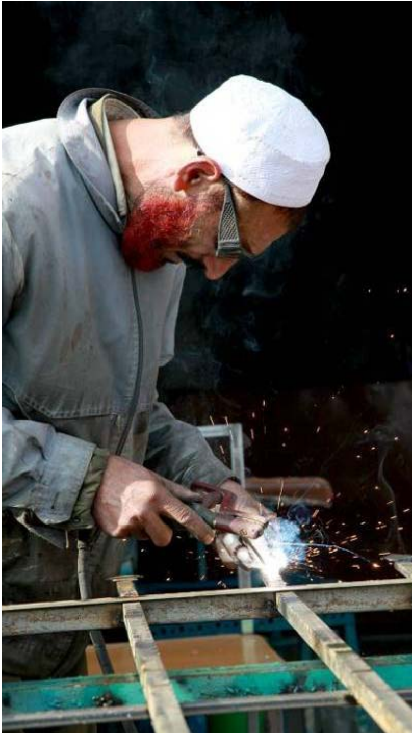
An Afghan local welds the end of a fence in Logar Province, Afghanistan, December 1, 2009. 091201-A-1748J-055