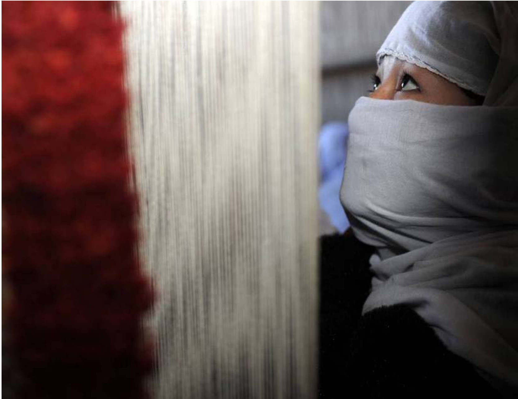
A woman from the returnee village just outside of Ghazni City, Afghanistan hand weaves a carpet to be sold in local shops. She is a participant of a vocational training program created by the local Non-Governmental Organization Humanitarian Assistance for the Development of Afghanistan with assistance from Provincial Reconstruction Team Ghazni. During the training, they were required to attend literacy and trade classes. 091203-F-8115W-003