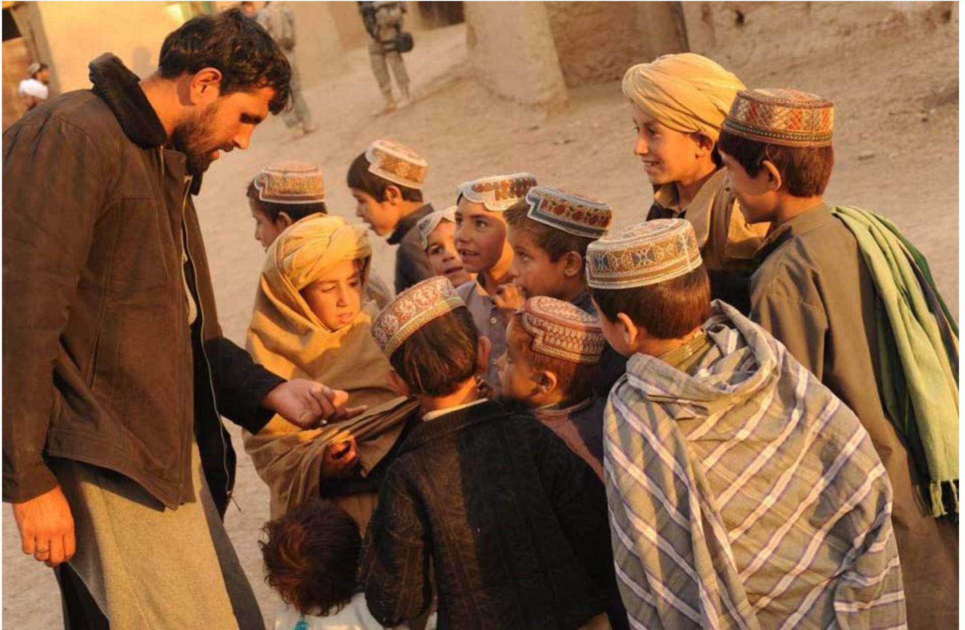
An Afghan National Police officer talks to Afghan children in the village of Shabila Kalan, Zabul Province, Afghanistan, Nov. 30, 2009. 091130-F-0212J-085