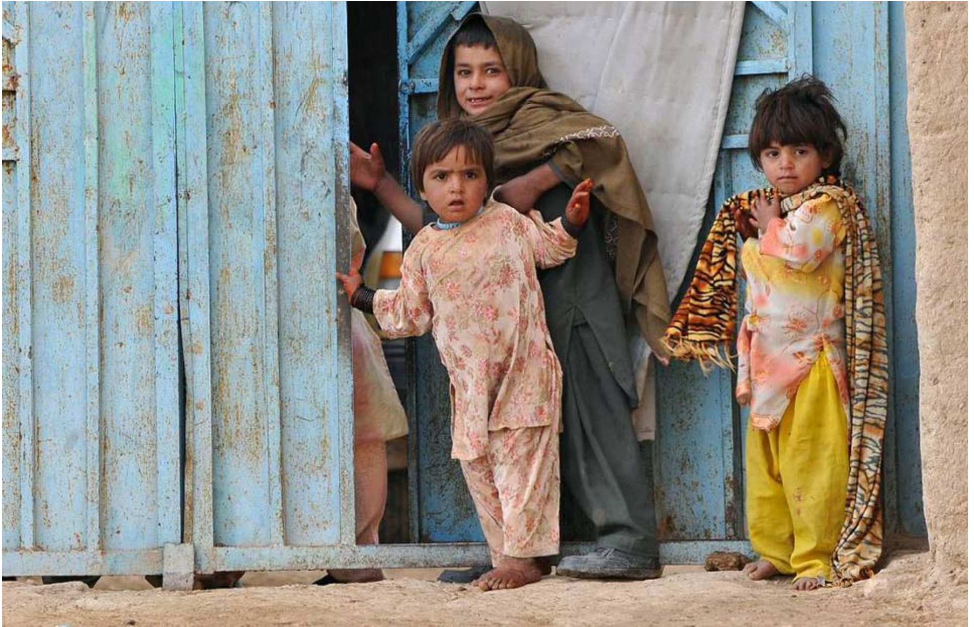
Afghan children watch U.S. Soldiers from 2nd Battalion, 1st Infantry Regiment, 5th Brigade, 2nd Infantry Division conduct a dismounted patrol through the village of Pir Zadeh, Dec. 3, 2009. 091203-F-0692M-037