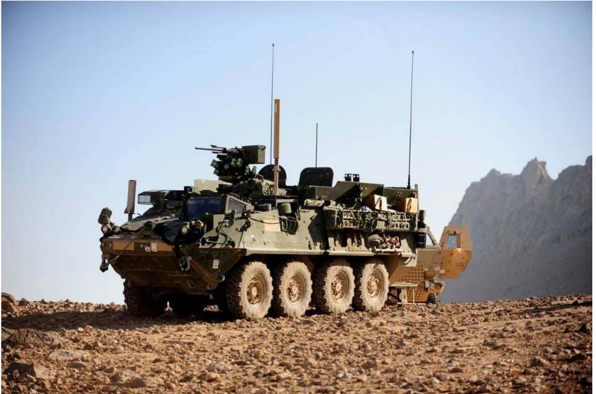
A Stryker armored vehicle operated by Soldiers with Charlie Company, 1st Battalion, 17th Infantry Regiment sits stationary at a patrol base, Rajankala, Afghanistan, Nov. 28, 2009. The U.S. Army operates from patrol bases to add flexibility to operations in their sectors. 091128-F-9891G-093