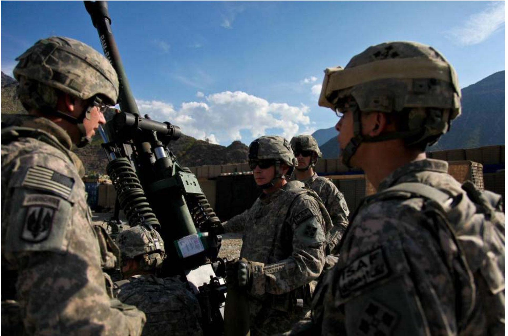
U.S. Army Soldiers assigned to Bravo Company, 2nd Battalion, 77th Field Artillery Regiment, 4th Brigade Combat Team, 4th Infantry Division, wait for orders to fire an M119 light-tow howitzer during artillery live-fire training at Combat Outpost Monti in the Kunar Province of Afghanistan on Dec. 2, 2009. 091202-A-6365W-117