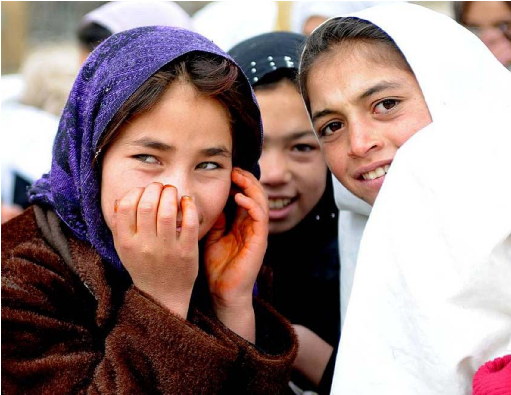
Girls from the district of Khawja Omari participate in classes being held outside at the all-girls school. Provincial Reconstruction Team-Ghazni visited the school that day to meet with school officials and discuss upcoming projects. 091130-F-8115W-007