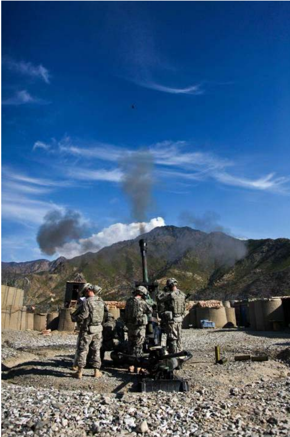
U.S. Army Soldiers assigned to Bravo Company, 2nd Battalion, 77th Field Artillery Regiment, 4th Brigade Combat Team, 4th Infantry Division, fire a 105 mm round with an M119 light-tow howitzer during live-fire training at Combat Outpost Monti in the Kunar Province of Afghanistan on Dec. 2, 2009. 091202-A-6365W-142