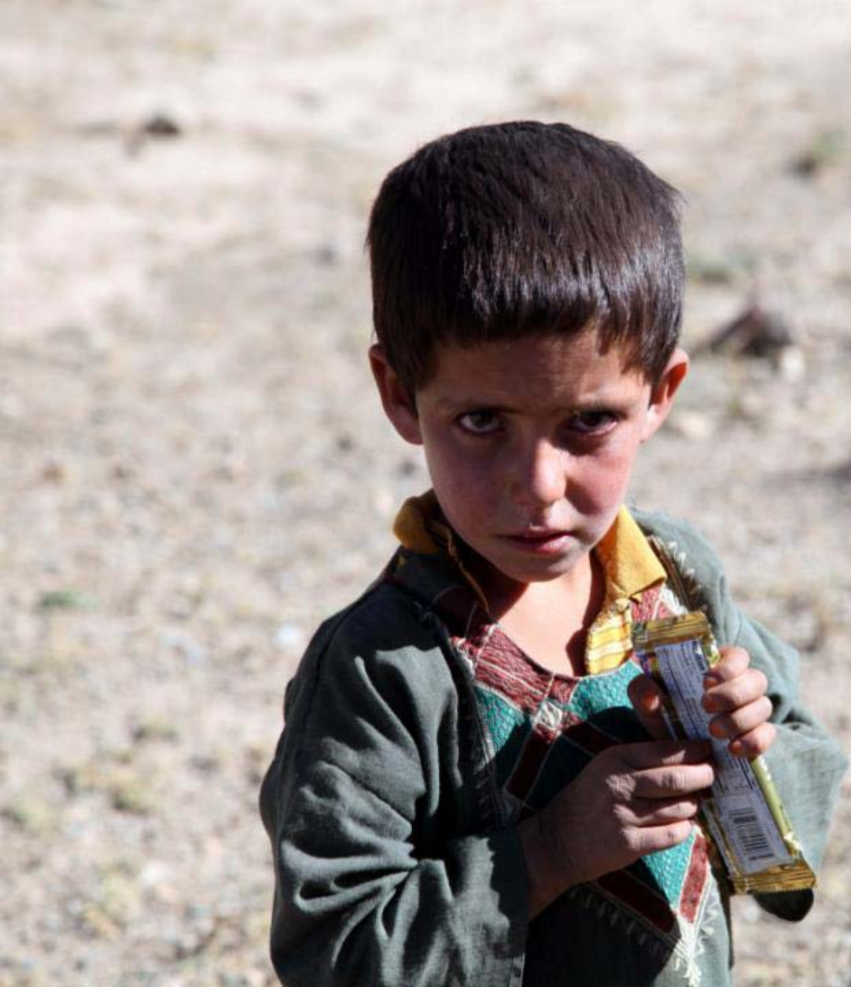
An Afghan child in Pansh Pai village, Khewar district, Logar province, Afghanistan, Oct. 7, 2010.