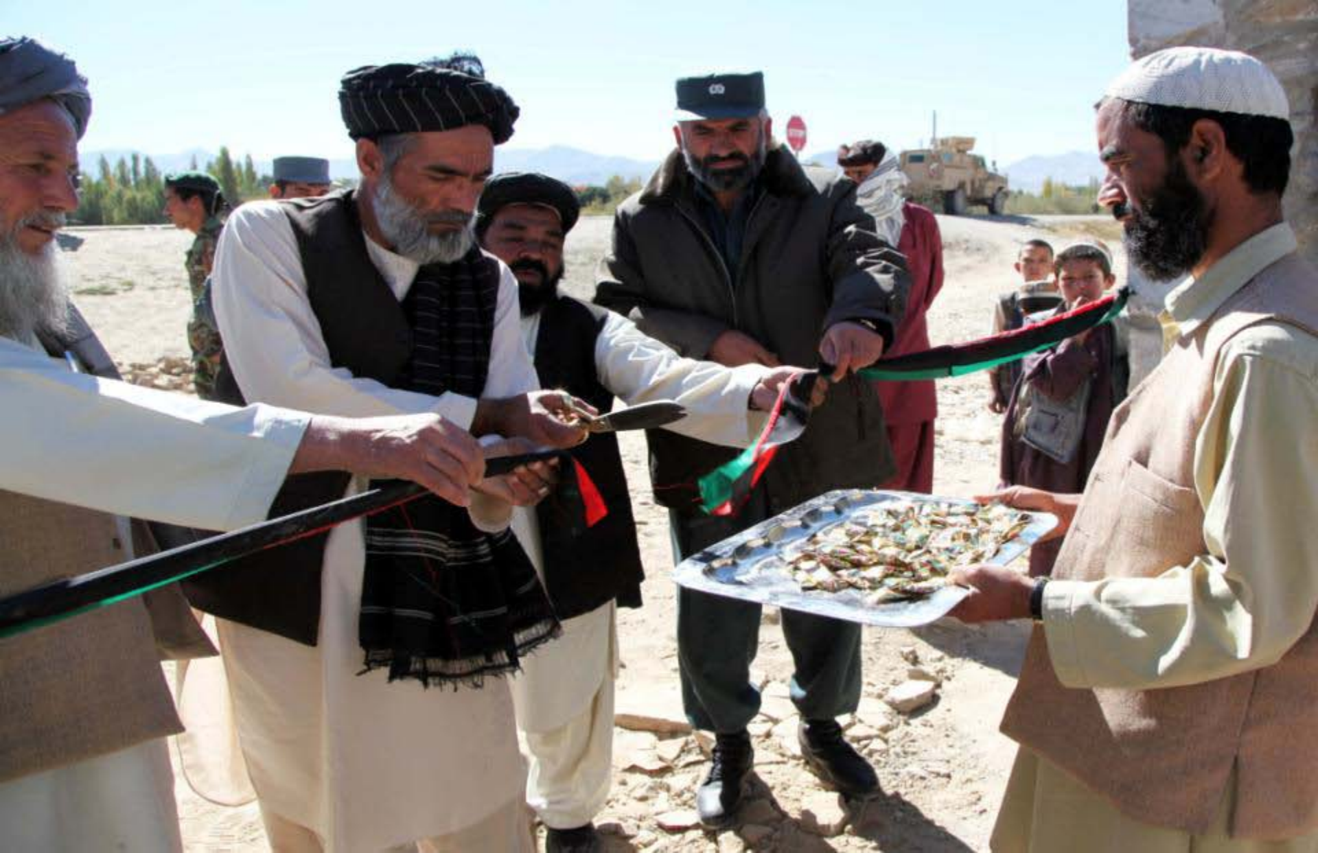
Afghan leaders cut a ribbon in celebration of the opening of Khalid Bin Walid Takya High School in Salar, Wardak province, Afghanistan, Oct. 7, 2010.