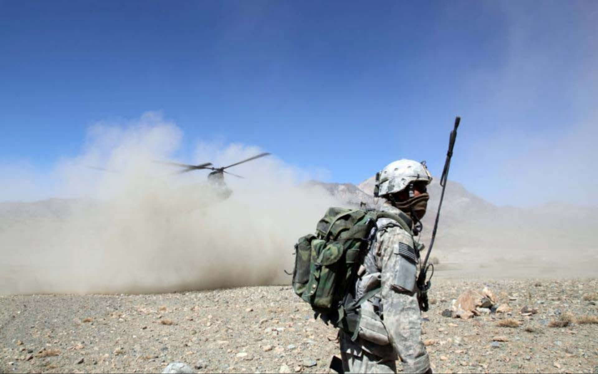
A Soldier with the 173rd Airborne Brigade Combat Team, 1st Squadron, 91st Cavalry Regiment, Comanche Troop waits for a CH-47 Chinook Helicopter to land at Pansh Pai village, Kherwar District, Logar province, Afghanistan, Oct. 7, 2010.