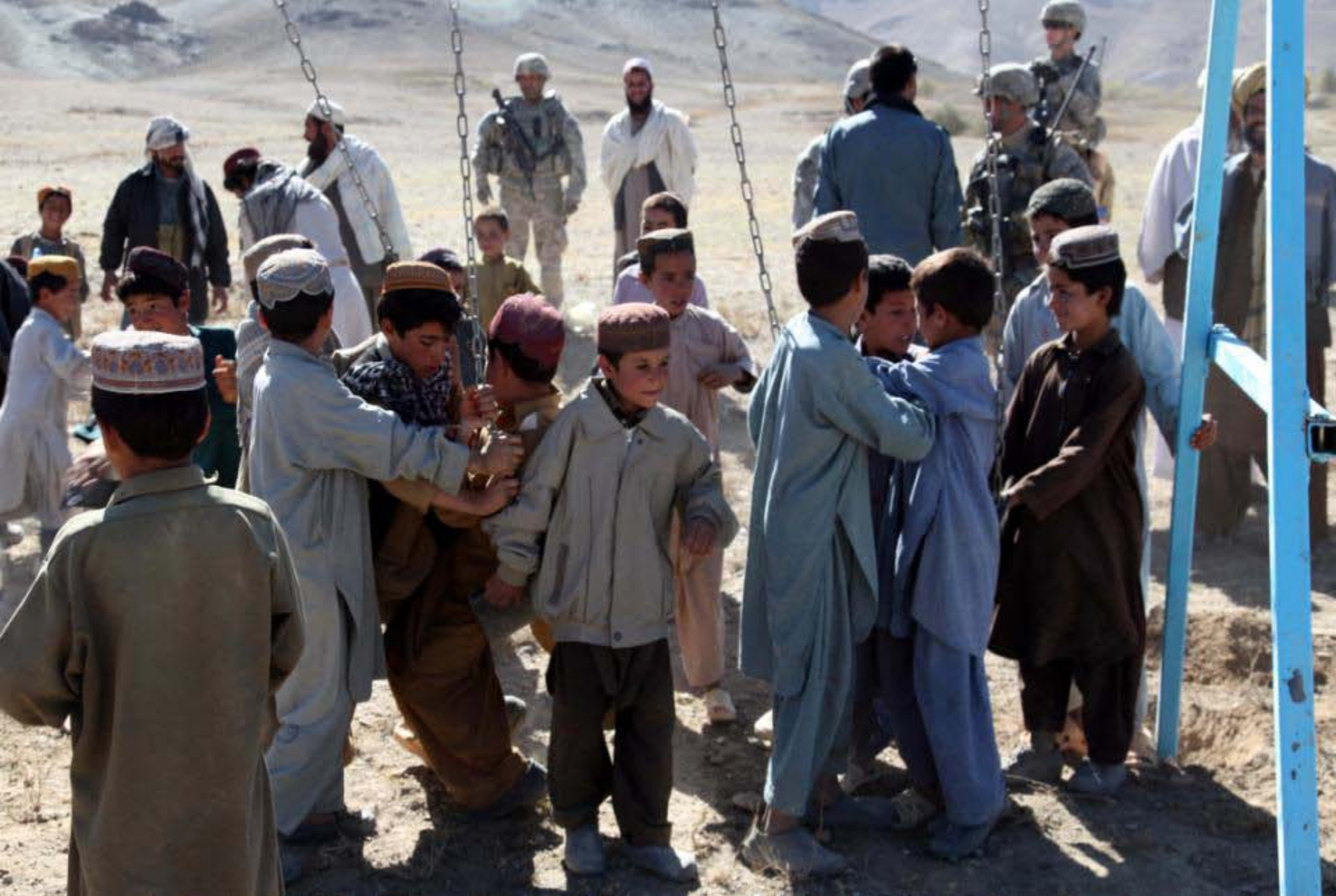
Afghan children from Pansh Pai village compete to get on a swing set built and delivered by the Afghan National Police and Soldiers of the 173rd Airborne Brigade Combat Team, 1st Squadron, 91st Cavalry Regiment, Comanche Troop, Kherwar district, Logar province, Afghanistan, Oct. 7, 2010.