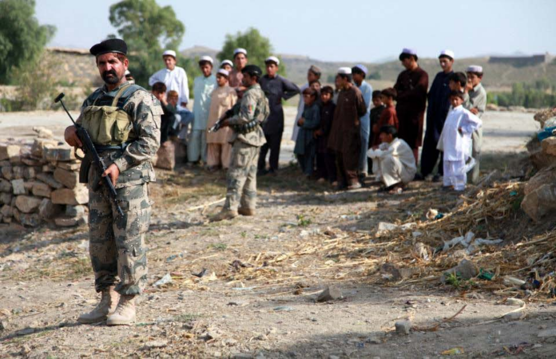
Afghan Soldiers provide security in the Loewan-Kala village, Khost province, Afghanistan, Sept. 25, 2010.