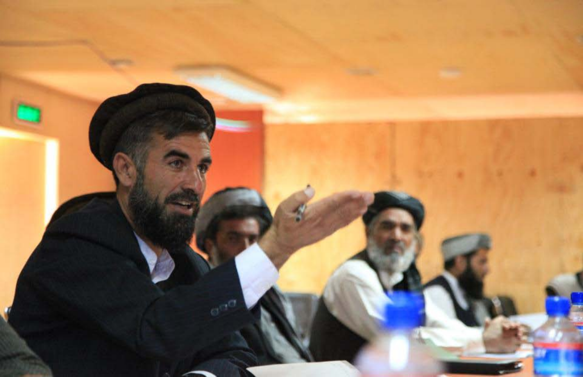
District Governors from Wardak and Logar provinces discuss pressing matters about their districts at Forward Operating Base Shank, Logar province, Afghanistan, Oct. 10, 2010.