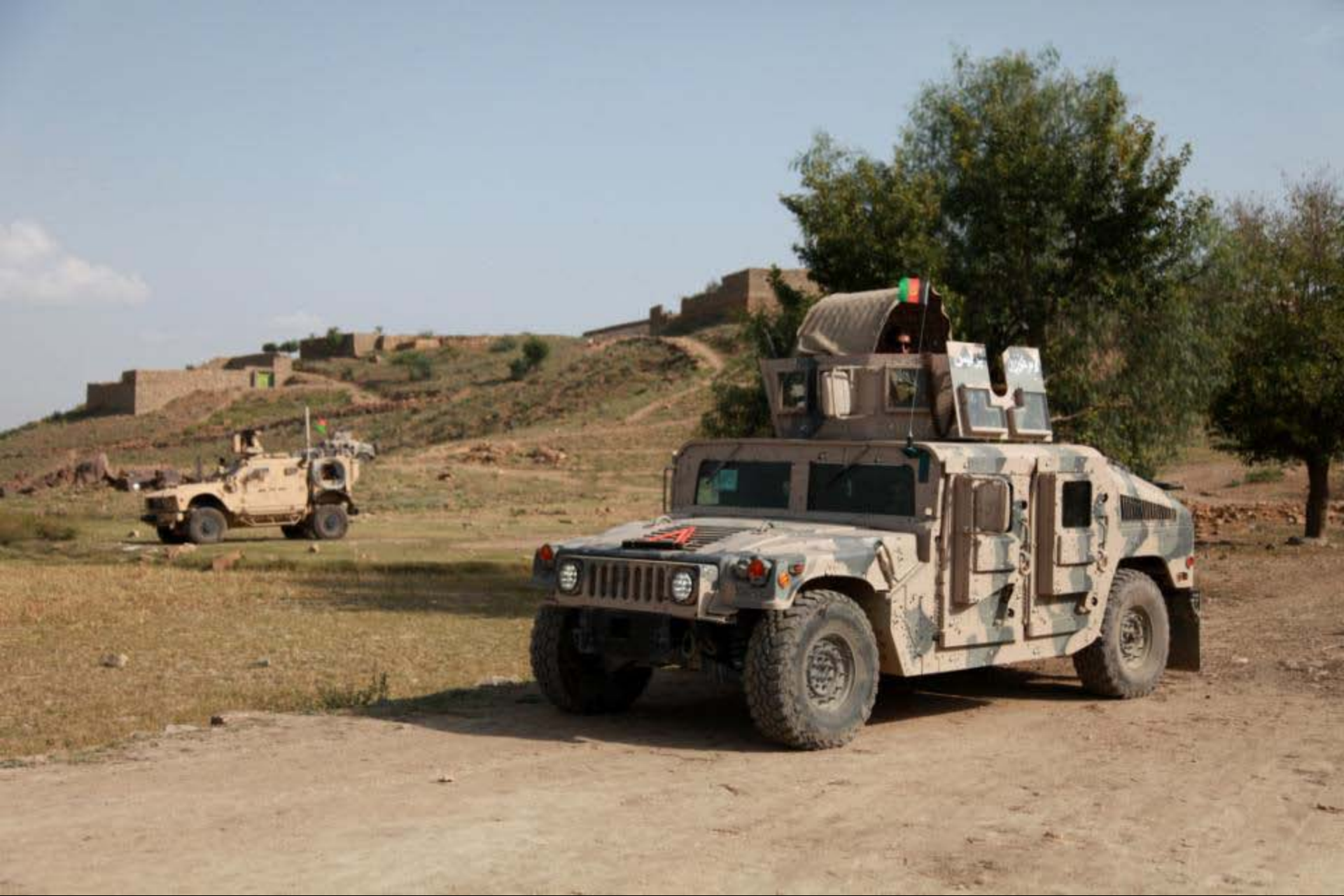
Afghan Border Patrol provides security at the Loewan-Kala village Terezayi district, Khost province, Afghanistan, Sept. 25, 2010.