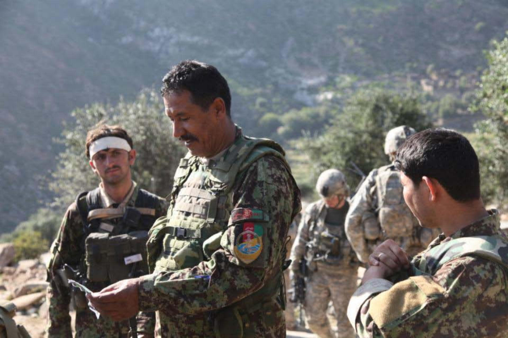
Afghan National Army in the Dewagal valley in Konar province, Afghanistan, Oct. 4, 2010.