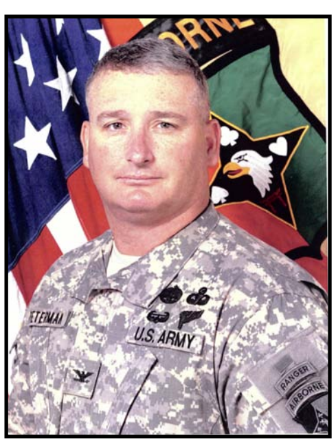
Commander, Task Force Lifeliners

Merry Christmas, Stay Safe, Army Strong LIFELINERS, AIR ASSAULT