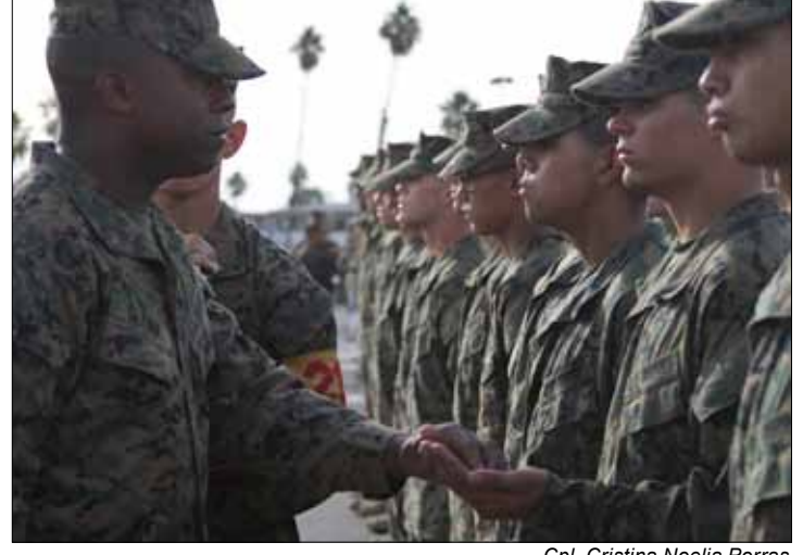
A new Marine from Company G holds the eagle, globe and anchor during an emblem ceremony at Weapons Field Training Battalion Nov. 10. During the emblem ceremony, 583 recruits received the coveted emblem from their drill instructors and were called Marine for the first time after completing the final test of recruit training, the Crucible.

instructors weren't screaming at the men. Instead, drill instructors offered the new armed forces. Still, they were Marines advice to use during segregated from other Marines their time in the Corps and reminded them never to forget Lejeune, North Carolina known what they had just accomplished.