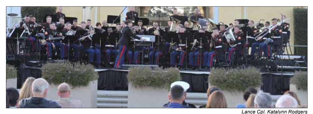
Marine Band San Diego serenades the crowd with festive holiday music during the annual Holiday Concert and Tree Lighting Ceremony Dec. 10.

Families gathered aboard Marine Corps Recruit Depot San Diego during the chilly evening Dec.10. Under lights of green, red and gold, they chatted merrily with one another as they settled down to watch the evening's events unfold.