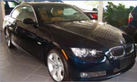
BMW 335i Convertible (PX51226) Monaco Blue Metallic, Saddle Brown Leather, Alarm, Automatic, Comfort Access, Cold Weather Package, I POD Adapter, Paddle Shifters, Sport Package, Satellite Radio, etc. total delivered price $ 44,995.-