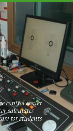
The control center er calculates ore for students