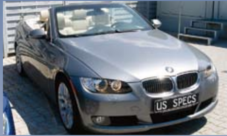
BMW 328i Convertible 2007 (PX11093) Space Gray Metallic, Cream Beige Leather, Cold Weather Package, I POD Adapter, Navigation, Premium Package, Park Distance Control, Sport Package, Cruise Control, CD Player, Power Windows, Power Locks, etc. total delivered price $ 43,995.-