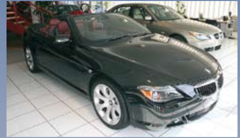
BMW 650i Convertible (CX58154) Black Sapphire Metallic, Chateau Pearl Leather, 2 Doors, Air Bag, Cold Weather Package, Comfort Access, Heads Up Display, Leather Interior, Premium Package, Sport Package, etc. total delivered price $ 75,995.-