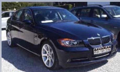
BMW 335i (PA66199) Monaco Blue met., Terra Dakota Leather, Alloy Wheels, Comfort Access, Heated Frontseats, Navigation, Premium Package, Sport Package, Fog Lamps, Floor mats, Leather Steering wheel, Multifunction for Steering Wheel, Rain Sensor, etc. total delivered price $ 39,995.-