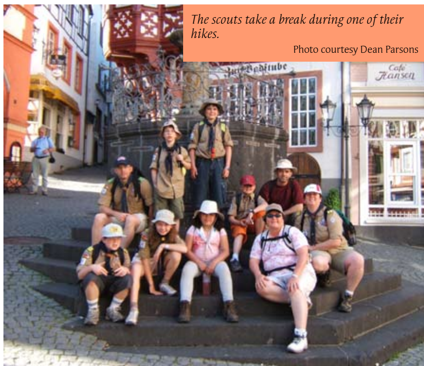
The scouts take a break during one of their hikes.

The Canadian Scouting movement is back and looking for new members boys and girls! If you would like more info for your child or to become a leader please visit www.scouts.ca or contact the 1st Geilenkirchen Scouting Group directly. Membership is open to children of all nationalities. We have already begun planning and it looks to be another great year, so why not enjoy Europe with us?