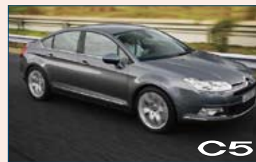
Citroën C5 NEW

Large selection of new cars Spare parts for Citroën