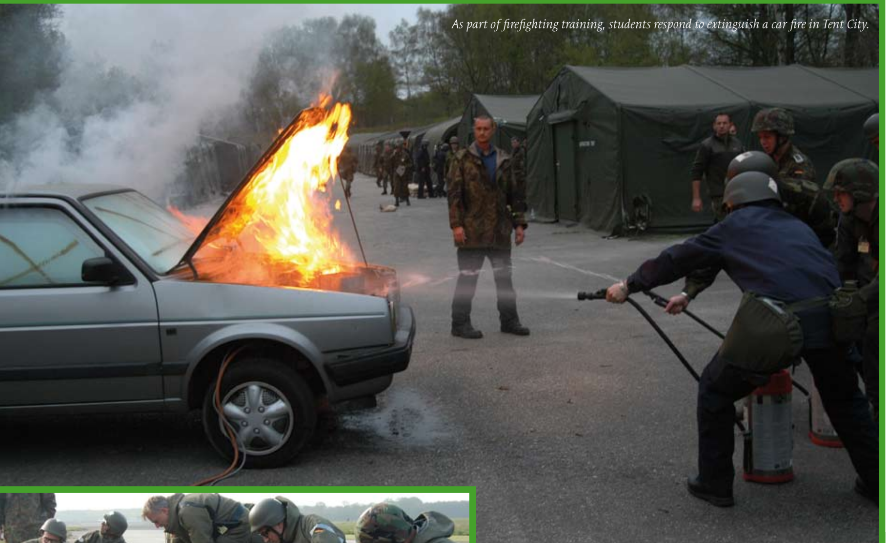
As part of firefighting training, students respond to extinguish a car fire in Tent City.