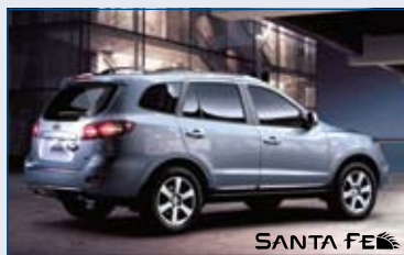
Hyundai Santa Fe

Diplomat sales New car sales Friendly English-speaking staff Original spare parts Service and maintenance