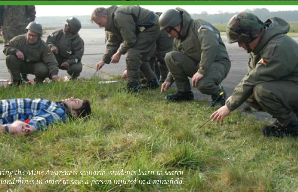
During the Mine Awareness scenario, students learn to search for landmines in order to save a person injured in a minefield.