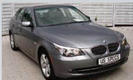
BMW 528xi (BZ45010) Arctic Metallic, Black Leather, 4 wheel drive, Automatic, Cold Weather Package, Front Comfort Seats, Navigation, Park Distance Control, Premium Package, Xenon Lights, Cruise Control, CD Player, Power Windows, Power Locks, etc. total delivered price $ 46,995.-