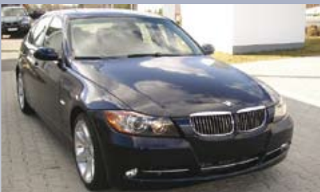
BMW 335xi (A007489) Sapphire Black, Black Leather, All wheel drive, Automatic, Dark Burl Wood Interior, Heated Seats, I POD Adapter, Sport Package, Power Windows, Power Sun Roof, Power Locks, Remote Keyless Entry, etc. total delivered price $ 37,995.-