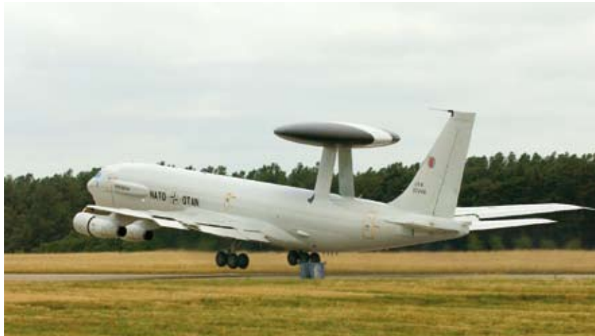
Last Legacy aircraft takes off for its NMT upgrade in Manching, Germany

Since 1982, the Legacy E-3A has successfully been part of historic NATO operations, flying for peace and security. After more than 25 years, the Legacy era is about to come to an end as the entire E-3A fleet will be NMT retrofitted this year. Also the Component's mission simulators will be completely NMT upgraded before the year is over. But the work does not stop there, and maybe it is even more appropriate to say that