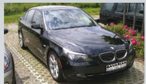
BMW 535i (CN56996) Jet Black, Beige Dakota Leather, Air Conditioning, Armrest, Alloy Wheels, Alarm, Automatic, Cruise Control, Chrome Line Exterior, Moonroof, Navigation, Power front seats w driver memory, Smoker's Package, Tire Pressure Monitor System, Xenon Lights, etc. total delivered price $ 45,995.-