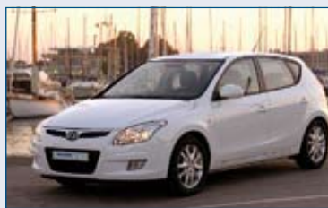
Hyundai I 30