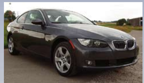
BMW 328i Coupe (PU89368) Sparkling Graphite Met., Black Dakota Leather, Air Conditioning, Cruise Control, Comfort Access, Fog Lamps, Heated Frontseats, I POD Adapter, Lights Package, Moonroof, Park Distance Control, Power front seats w driver memory, Rain Sensor, Smoker's Package, Tire Pressure Monitor System, Xenon Lights etc. total delivered price $ 35,995.-