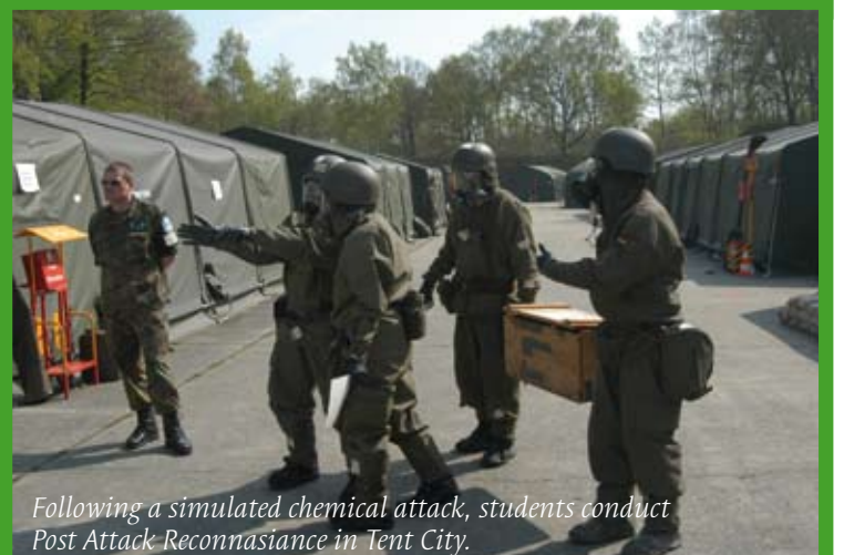
Following a simulated chemical attack, students conduct Post Attack Reconnaissance in Tent City.