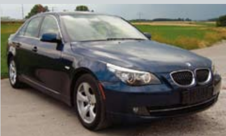
BMW 528i (BY65061) Monaco Blue Metallic, Saddle Brown Leather, Air Conditioning, Alarm, Cold Weather Package, CD Player, Cruise Control, Comfort Package, Heated Frontseats, I POD Adapter, Navigation, Power Seats, Premium Package, Power Windows, Power Sun Roof, Power Locks, Park Distance Control, Xenon Lights, etc. total delivered price $ 44,995.-