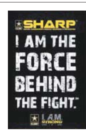
Special care available to sexual assault victims