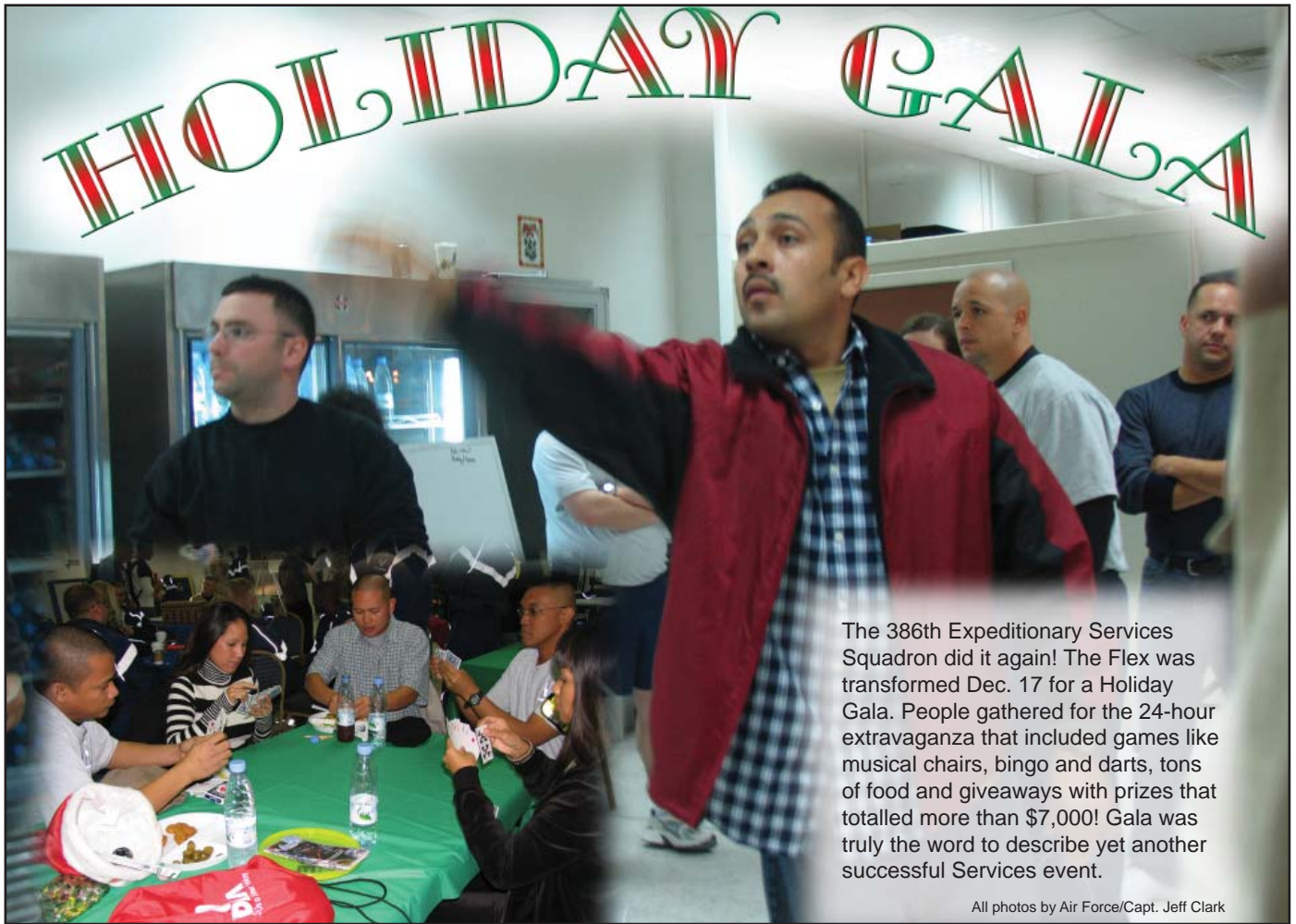
The 386th Expeditionary Services Squadron did it again! The Flex was transformed Dec. 17 for a Holiday Gala. People gathered for the 24-hour extravaganza that included games like musical chairs, bingo and darts, tons of food and giveaways with prizes that totalled more than $7,000! Gala was truly the word to describe yet another successful Services event.