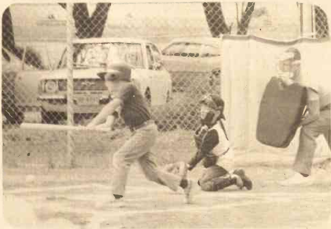
A DODGER BATTER TRIES to get the drop on the ball during last Saturday's game against the Orioles in K-Bay's youth Training League. The Orioles squeaked by the Dodgers, 7-6, in a close game at K-Bay's Little League field.