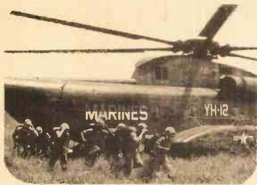
IN THE LZ - Marines of Echo Company, 7th Marines, 1st Marine Division, Camp Pendleton, unload from a CH-53 helicopter in a hotly contested landing zone on Molokai, during Phiblex-3 on Tuesday.