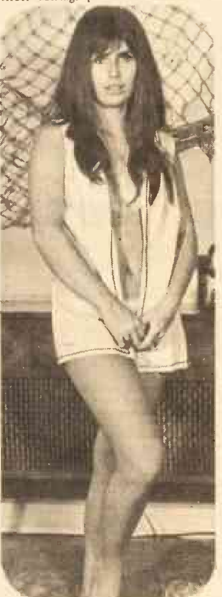
NOBODY WANTED ME to be their Water Carnival Queen contestant might be what this week's Windy Girl is saying. Actually, she just wants to remind you to vote for the Queen of your choice and be sure to attend the 12th Annual K-Bay Water Carnival on May 19, 20 and 21.

Copy submitted by anyone after the established deadlines will not normally be used until the following week. Determination of the use will be made by the Editor and the Joint Public Affairs Officer.