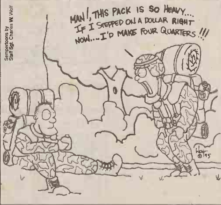
Illustration by Staff Sgt. Charles W. Wolf

Super Sitters Class will give youth ages 12-18 years old the knowledge and confidence nec-