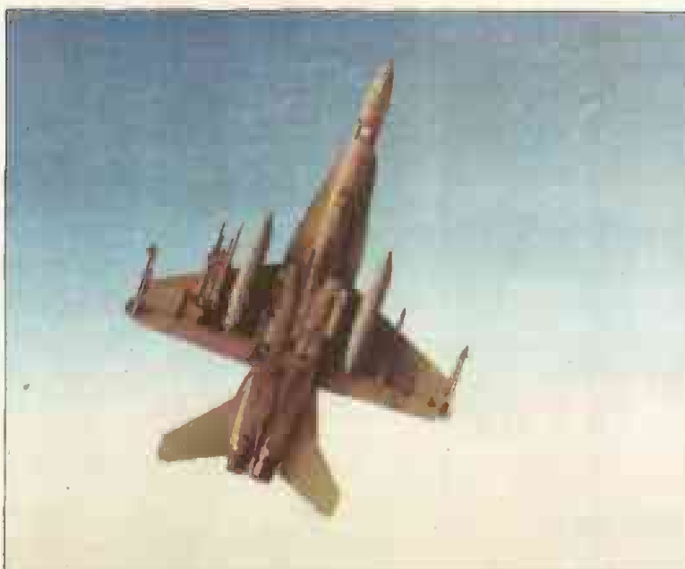
A Marine Aircraft Group 31 F/A-18D flies out of Tazsar, Hungary as a part of the NATO-led security mission in Kosovo.