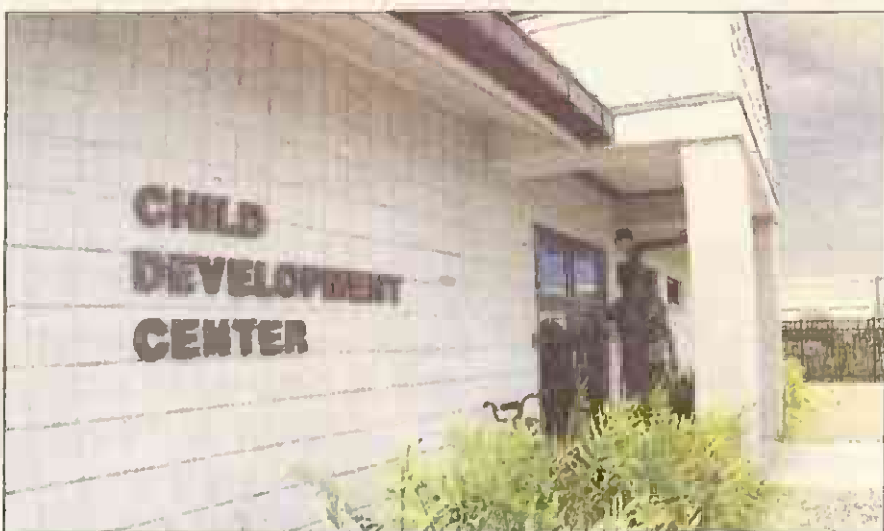
The K-Bay Child Development Center will announce the amount of its cost hike after reviewing current and expected future expenses.