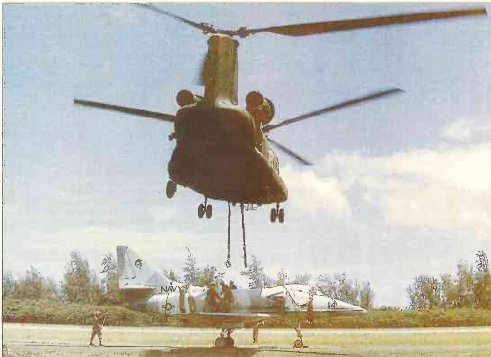
A CH-47D Chinook helicopter hovers over a static display that was rigged for transport by MCB Hawaii's Landing Support Platoon, Landing Support Company, Combat Service Support Group 3 at Dillingham Army Airfield July 8.