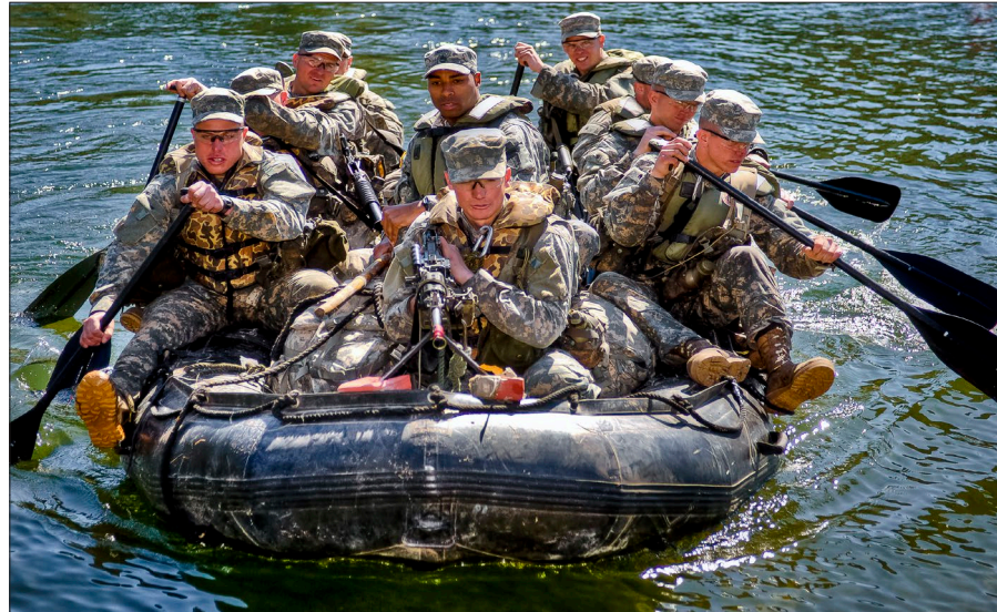
Ranger trainees demonstrate teamwork during a raft assault. The Army is now calling for female volunteers to possibly attend a Ranger assessment course in the spring.