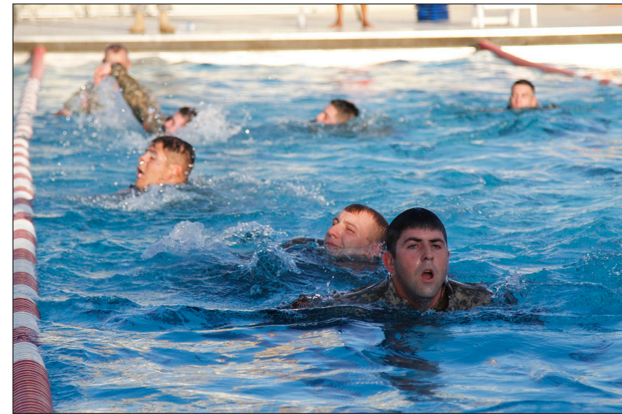
Above Soldiers assigned to B Company, 2nd Battalion, 5th Cavalry Regiment, 1st Brigade Combat Team, 1st Cavalry Division, perform the swim portion of a triathlon, Sept. 5, 2014, at Fort Hood, Texas.