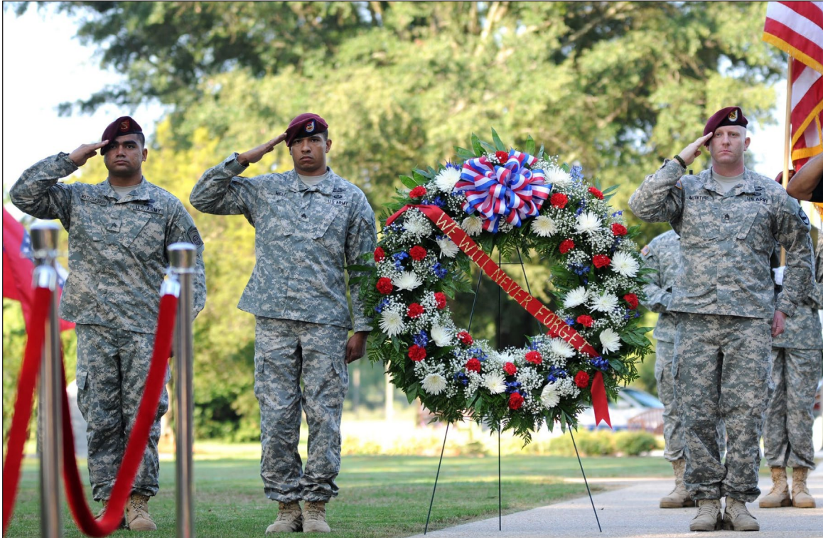
Left Paratroopers salute during the Sept. 11, 2014, Remembrance Ceremony at Fort Bragg, N.C. Local leaders, service members, first responders and Family members attended the event, commemorating the 13th anniversary of the attacks on the World Trade Center and the Pentagon.

Here are the best photos from FORSCOM Public Affairs professionals world-wide. For more photos and information, click these photos or visit army.mil/forscom