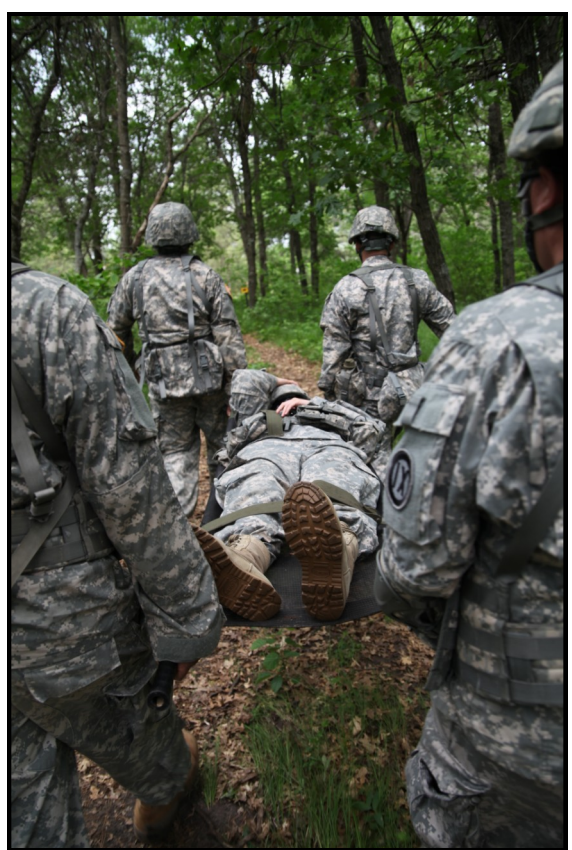
1984th Soldiers carry a litter with a simulated casualty during the nine-obstacle litter obstacle course during extended combat training.

During the ECT, the 1984<sup>th</sup> USAH conducted intense training in support of their mission: be ready to provide medical personnel in support of contingency operations worldwide.