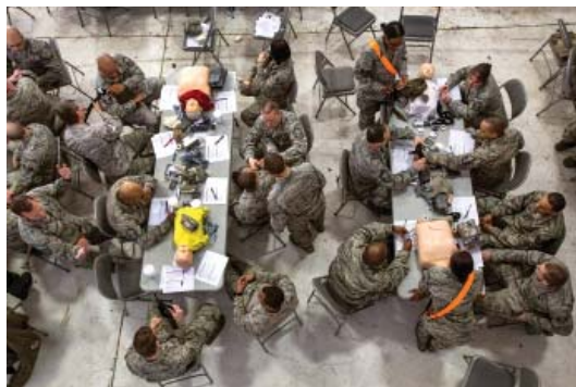
Airmen from the 108th Wing, practice self-aid buddy care skills during the Wing's Expeditionary Skills Rodeo March 6, 2015.

"It gets us in line with NGB's (National Guard Bureau's) new ancillary