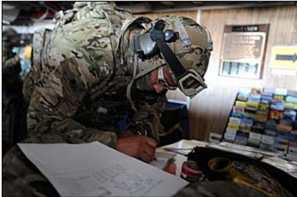
The U.S. Coast Guard Maritime Security Response Team out of the Chesapeake, Virginia area conducts a short notice maritime response training exercise in Mackinaw City, MI.

The Michigan National Guard is in planning discussions with the Alaska National Guard, Alaska Command, and other service branches and local agencies for Arctic Eagle 2016.