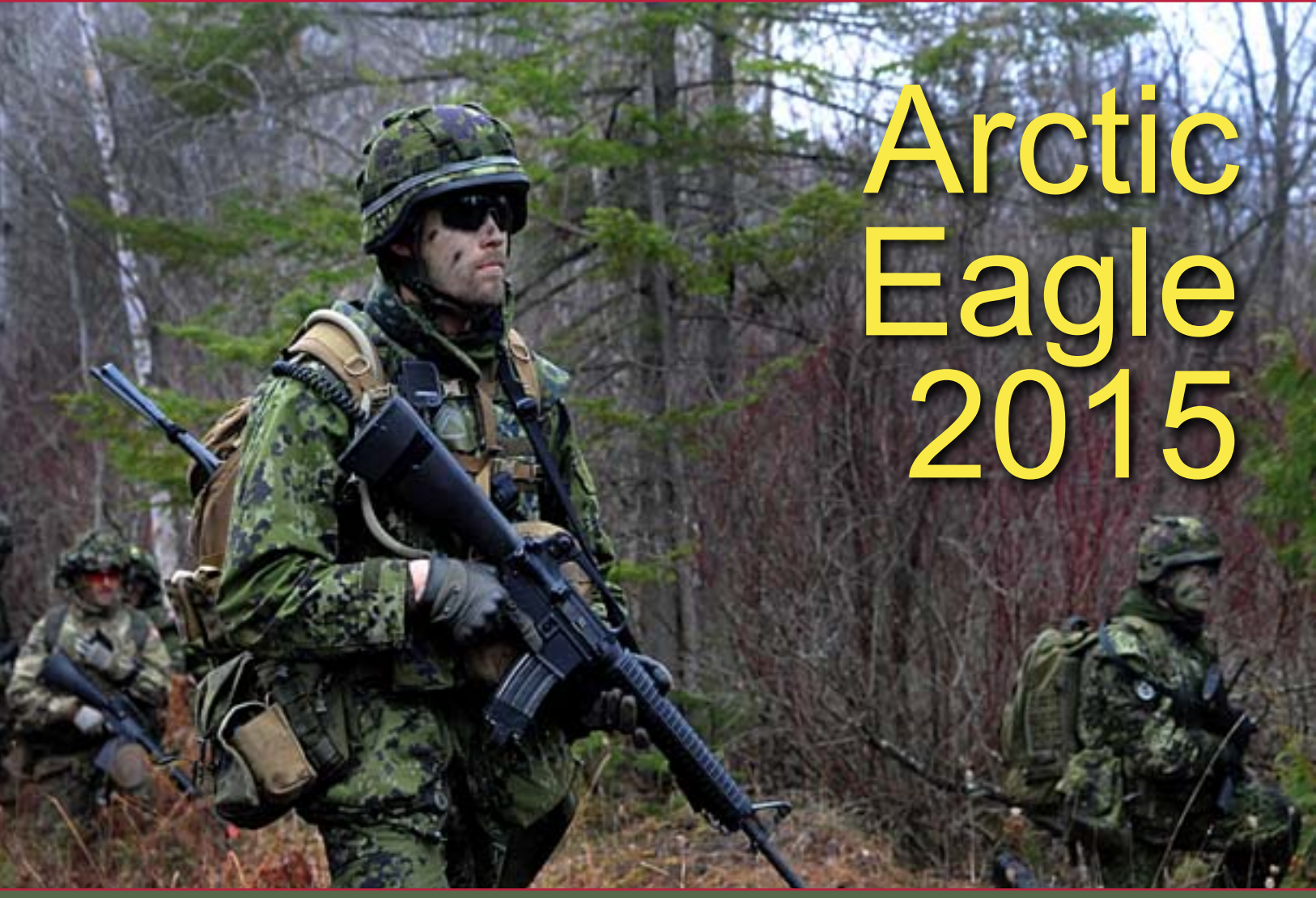
The Danish Army and Bravo Company, 125 Infantry Battalion, Michigan Army National Guard, conduct tactical squad maneuvers while taking back a port from a simulated terrorist group, during Arctic Eagle, in Rockport, Mich., April 22, 2015.