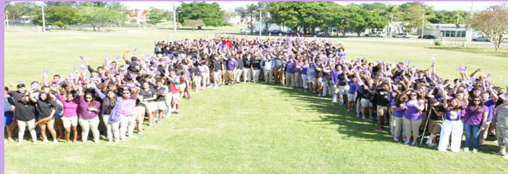
In honor of the Month of the Military Child, hundreds of Fort Buchanan military children formed a human purple ribbon on April 27.