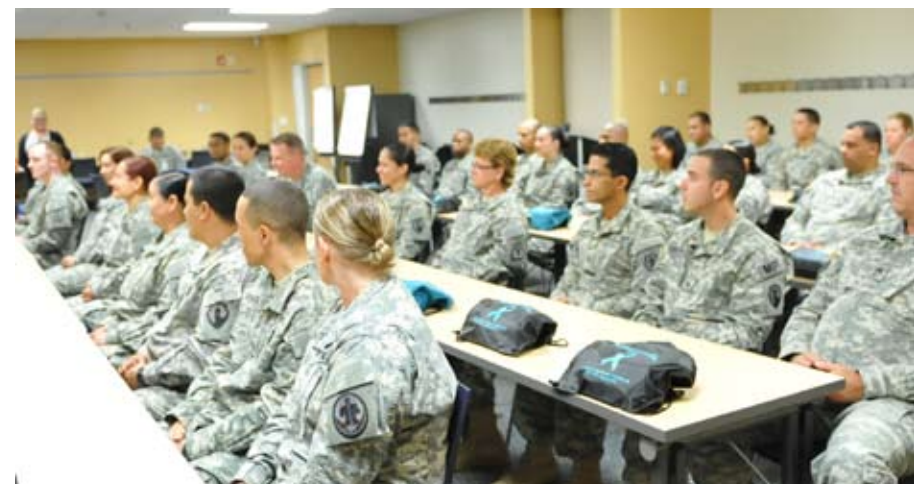
Sexual Harassment/Assault Response and prevention (SHARP) certification course was held at Fort Buchanan, June 15-26, as part of the U.S. Army's requirements for sexual assault response coordinators and victims advocates by the 1st Mission Support Command, U.S. Army Reserve-Puerto Rico.

Throughout the course, students are taken through self-awareness training, the social science behind sexual violence, power dynamics, resiliency training, effective communication, how to respond to sexual harassment and assault, participate in practical exercises, hear from guest speakers, participate in leadership panels and other things that give them a deeper and broader education.