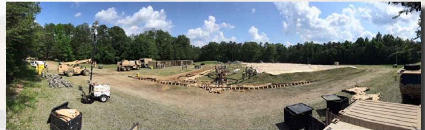
Approximately 140 soldiers from the 941st QM Co. U.S. Army Reserve -Puerto Rico are currently conducting their 2015 Annual Training at AP Hill, VA. As part of the exercise, the troops installed a FSSP operations (fuel system supply point) with about 75,000 gallons of fuel.

FORT PICKETT, Va. - In Laurence Binyon’s poem about remembrance, “For the Fallen” he writes, “They shall not grow old, as we that are left grow old. Age shall not weary them, nor the years condemn. At the going down of the sun and in the morning, We will remember them.”