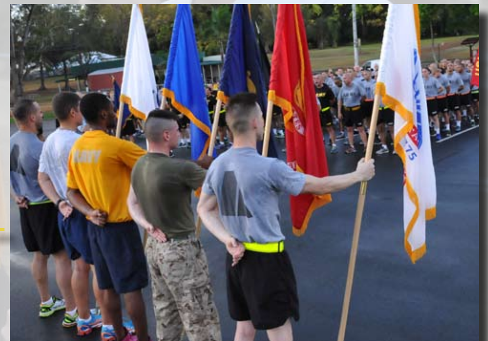
Service members assigned to military units in Puerto Rico, stand in formation after finishing the Armed Forces Run on May 15, at Fort Buchanan, Puerto Rico.

Armed Forces, serving in every conflict since World War I. It is estimated more than 10,000 active duty military personnel from Puerto Rico serve across the branches of the U.S. Armed Forces.