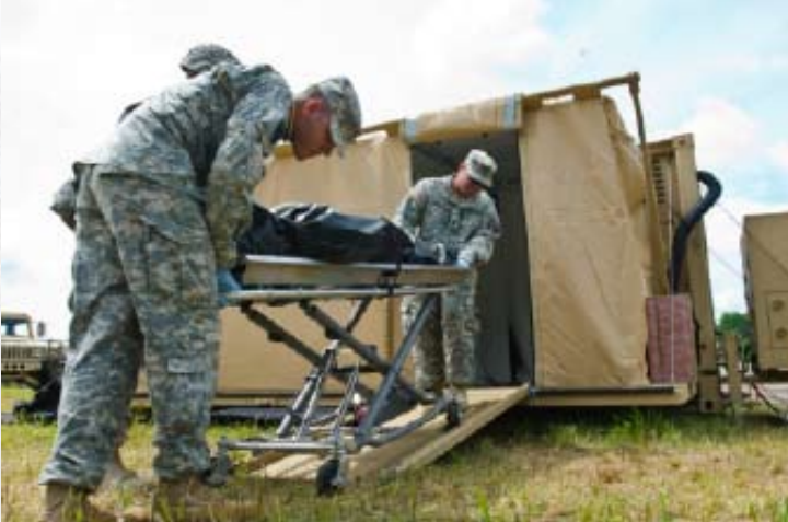
LEFT- Soldiers with the 246th Quartermaster Mortuary Affairs Company, during simulation of a theatre mortuary evacuation point ceremony during the 2015 Mortuary Affairs Exercise at Fort Pickett, Va., May 29, 2015. The Mortuary Affairs Exercise is the first of its kind, bringing together five Army Reserve mortuary affairs units and one active duty mortuary affairs unit to train together and share their knowledge.