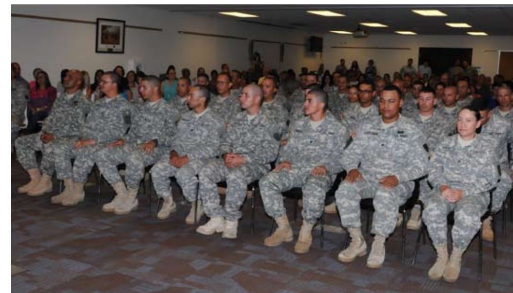
Warrior Leaders Course (WLC) graduates recognized at the regional Training Institute in Fort Allen, Juana Diaz Puerto Rico, May 1st, 2015.