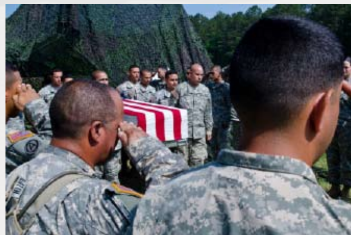
Soldiers with the 246th Quartermaster Mortuary Affairs Company, salute the the remains of a fallen Soldier during simulation of a theatre mortuary evacuation point ceremony during the 2015 Mortuary Affairs Exercise at Fort Pickett, Va., May 29, 2015. The Mortuary Affairs Exercise is the first of its kind, bringing together five Army Reserve mortuary affairs units and one active duty mortuary affairs unit to train together and share their knowledge.