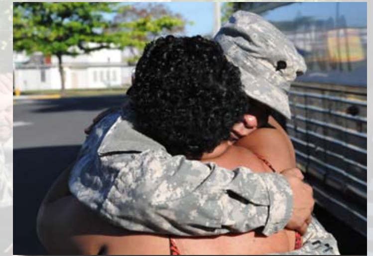
Soldiers from the 271st Human Resources Company, U.S. Army Reserve-Puerto Rico say goodbye to their family members at Fort Buchanan, Puerto Rico, on April 22, 2015