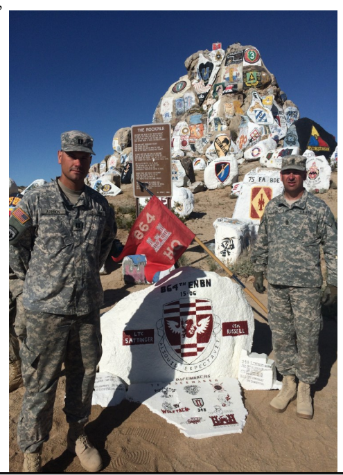
Commander and First Sergeant at NTC