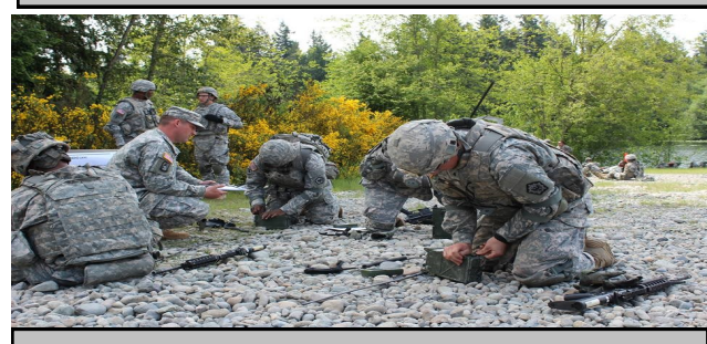
3rd Platoon completes a lane at Roughneck Stakes