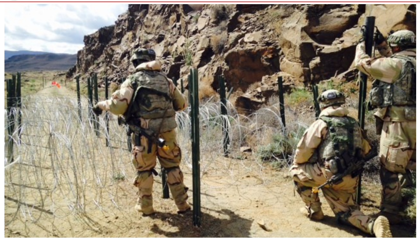
3rd PLT emplaces an 11-Row wire obstacle while support 1-23IN at Yakima in April 2015