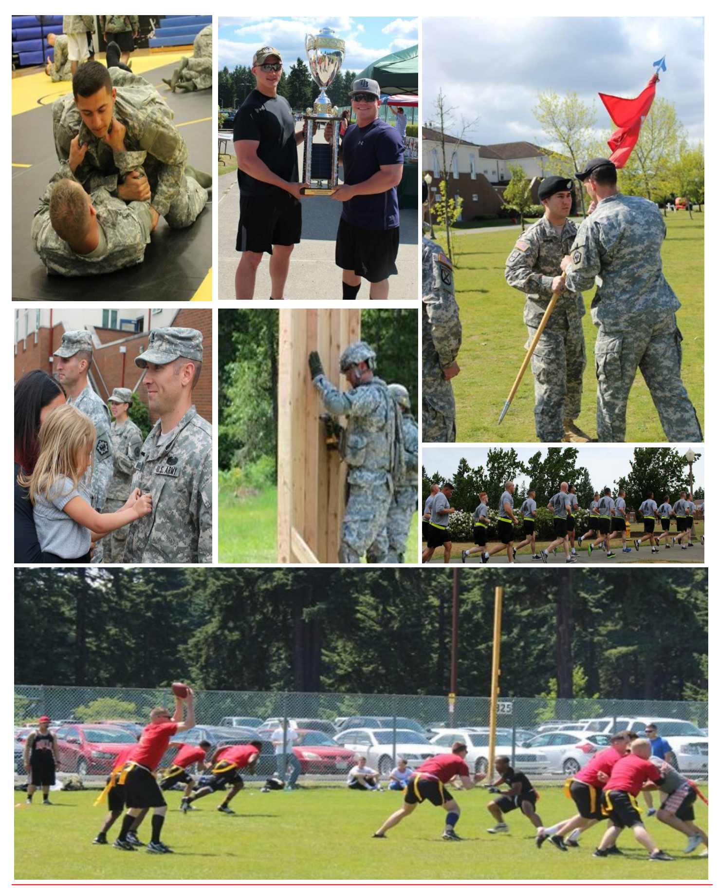
RISE TO THE CHALLENGE!