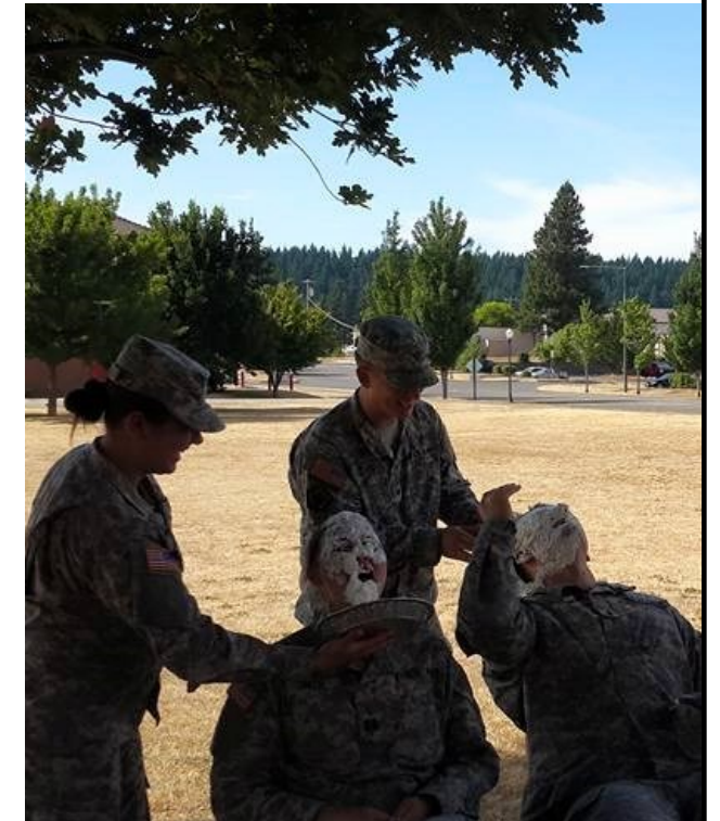
Regulators enjoying FRG Pie in the Face