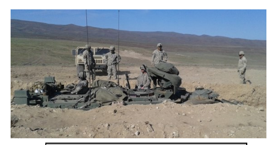
Stryker Turret Defilade Fighting Position dug by the EQ Platoon at YTC Rotation