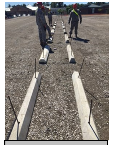
2nd Platoon emplacing 70 parking stops at the Okubo Family Medical Clinic