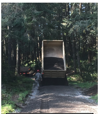
3rd Platoon hauled and spread over 2,000 cubic yards of crushed gravel along Solo Point Run Trail!