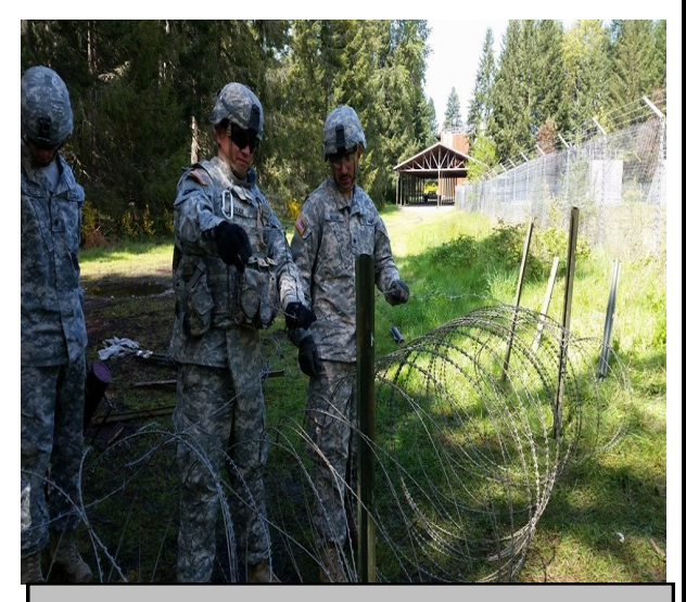
3rd Platoon "WolfPack" work on countermobility tasks by emplacing wire obstacles.