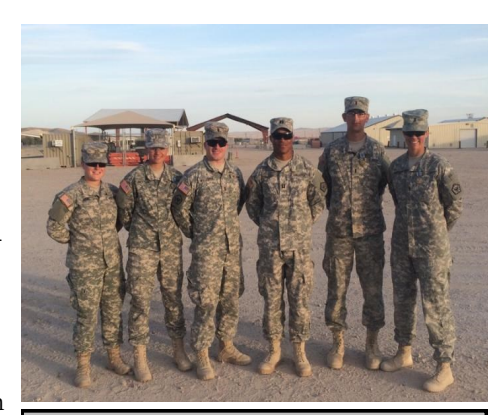
FSC officers before redeployment from $\operatorname{NTC}$

Throughout the 3rd Quarter, your loved ones have continued to achieve. From the National Training Center to various ranges and field exercises, our Soldiers have been at the forefront of logistics. The blunt reality is that although this is an engineer battalion, no training can occur without the solid backbone of the FSC. The outstanding work that our Soldiers put in to maintenance, transportation, supply, ammo, and fuel continues to allow the engineers to shoot, move, and communicate. We have navigated a plethora of obstacles this quarter including a 30 day deployment to the National Training Center, Combat Lifesaver Training, Warrior Stakes support and participation, physical fitness training, and weekly sergeant's time training. All of these events could not have been a reality without the support that you provide for your loved one. We as a command team look forward to another quarter of hard work and I appreciate everything you and your loved one do for this company. Providers!