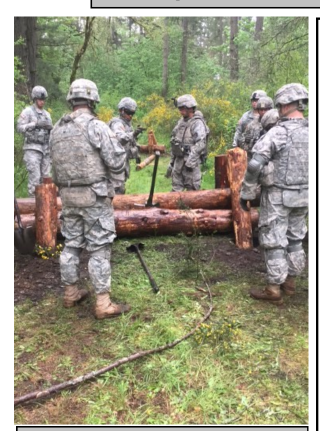
2nd PLT emplaces a Log Crib during the VALDEX in May 2015