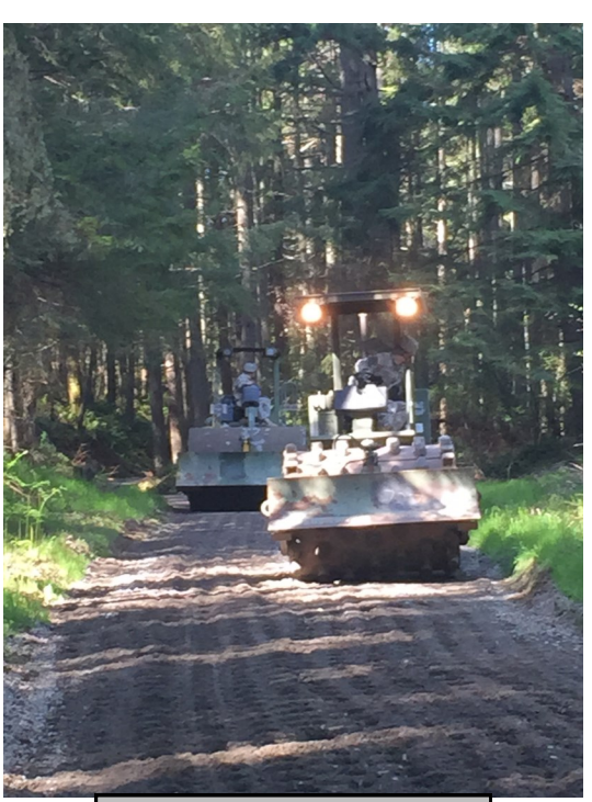
Ghostriders compacting the Solo Point Run Trail.