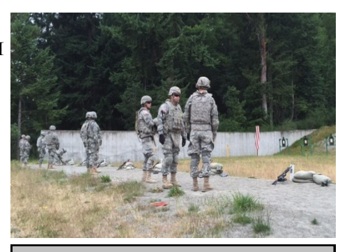
Soldiers participating in the M4 qual range

As the senior enlisted advisor to the commander, it is my job to affirm the strength of our NCO corps and groom all Soldiers in our company to become tomorrow's leaders. Once again our Soldiers have performed exceptionally and I have the utmost confidence that they are the next generation of the Army's finest. The main focus of this quarter was to perform in a deployed environment at the National Training Center with all of the training we have accomplished. I am happy to say that we passed our company certification with flying colors. Otherwise, it has been business as usual for the Providers and we have been working to maintain our basic soldiering skills, physical fitness, and weapons training. However, mentorship is the standard for the command and we are always looking to improve. I am proud to say that we had 2 Soldiers join the NCO corps and 3 Sergeants pin the rank of Staff Sergeant over the past 90 days. Regardless of the amount of emphasis placed on training and readiness, nothing is a higher priority to this company than the Soldiers in our formation. I hope that you all had a safe 3rd quarter and I look forward to working with you all next quarter.