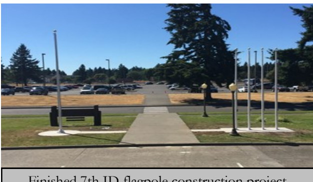
Finished 7th ID flagpole construction project.