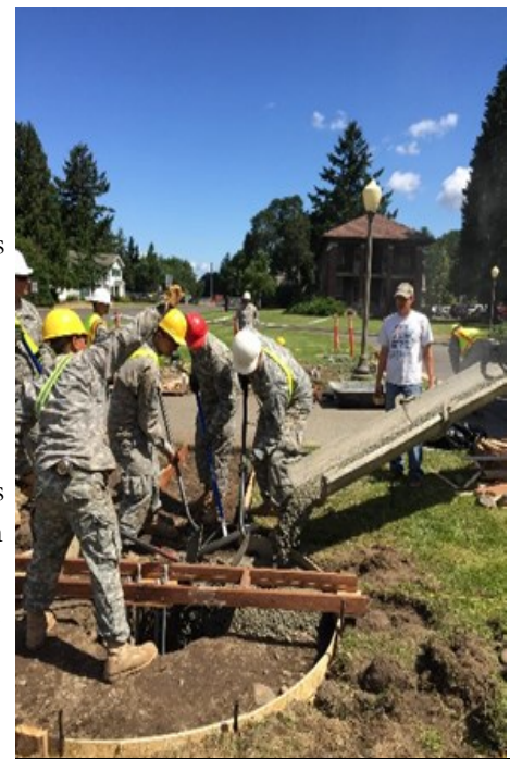
2nd Platoon placing concrete for the 7th Infantry Division Headquarters' BLDG flagpoles.