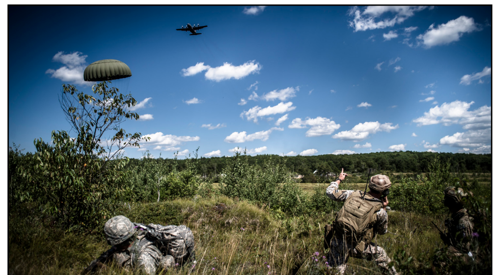
Abundle of Meals, Ready to Eat parachute in as Latvian joint terminal attack controllers guides in a second C-130 Hercules for a resupply training mission as on July 23, 2015 at Grayling Air Gunnery Range during Exercise Northern Strike 2015. Exercise Northern Strike 2015 is a joint multi-national combined arms training exercise conducted in Michigan.

Aircraft from more than a dozen military units operated in northern Michigan over the past several weeks as part of a major training exercise involving military personnel from Canada, Latvia, Poland, Australia and 20 states' military forces. Northern Strike was unique in that it combined both air and ground combat capabilities in one training exercise.