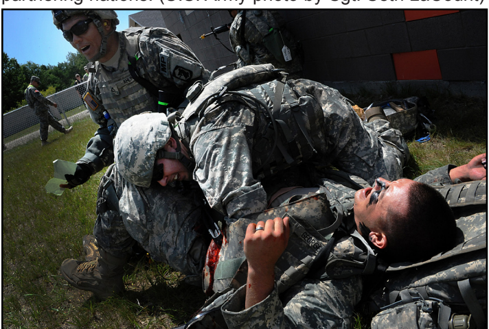
Members of the 233rd Military Police Company, Springfield, Ill., perform medical rescue operations after a simulated improvised explosive device goes off during urban operations training on July 23, 2015 at the Combined Arms Collective Training Facility, Grayling, Mich., during Northern Strike 15.