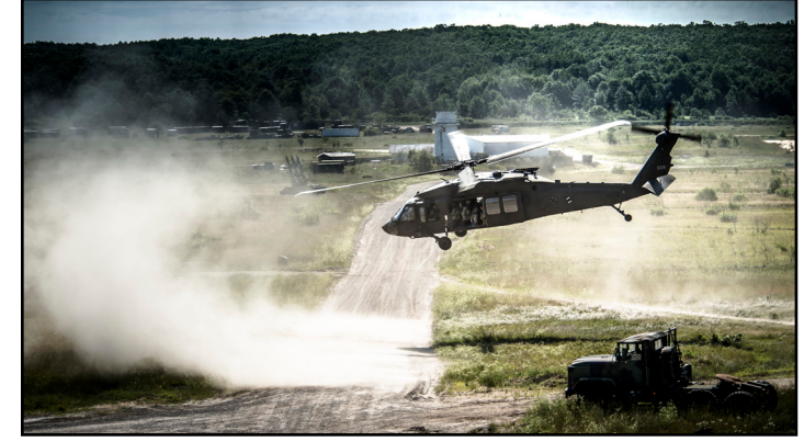
A UH-60 Black Hawk transpots 125th Infantry Regiment A Company Detroit, Michigan on a training mission on July 23, 2015 during Exercise Northern Strike 2015 at Grayling Air Gunnery Range in Grayling, Michigan. Exercise Northern Strike 2015 is a joint multi-national combined arms training exercise conducted in Michigan.