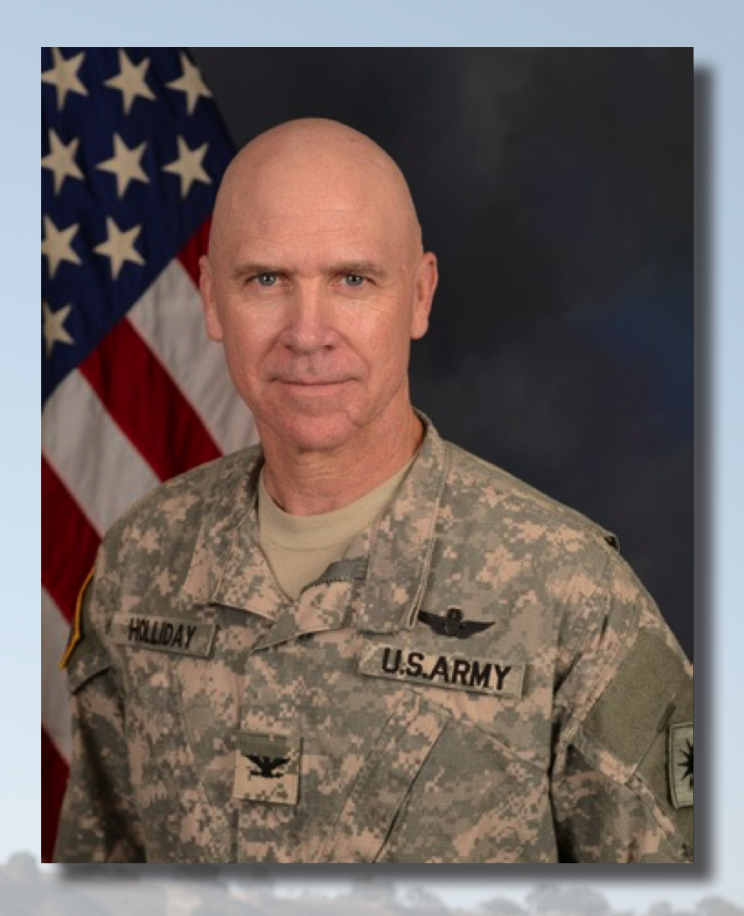
Public Affairs Officer