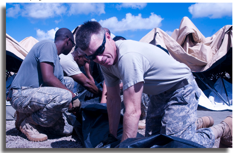
Soldiers from the 40th Combat Aviation Brigade staff and supporting elements tear down their tactical operations center during Warfighter 15-05 at Fort Hood, Texas, June 12.