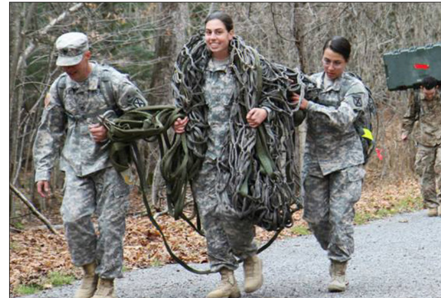
Above Soldiers assigned to 2nd Brigade Combat Team, 10th Mountain Division, move military equipment through a 2-mile trail to compete for the best time during an eight station Commandos Veteran Day challenge, Nov.11, 2015, on Fort Drum, N.Y.