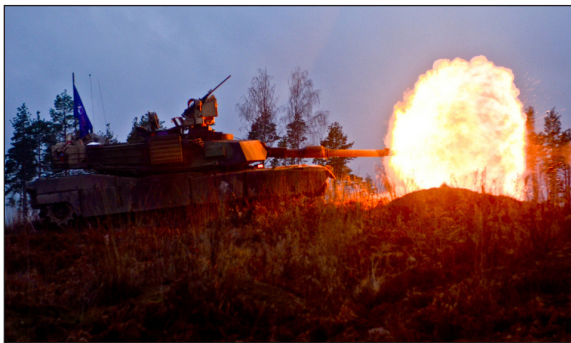
Above Soldiers of the 3rd Battalion, 69th Armor Regiment, 1st Brigade, 3rd Infantry Division, fire a M1A2 Abrams Tank on Tapa Army Base, Estonia, Nov. 13, 2015.