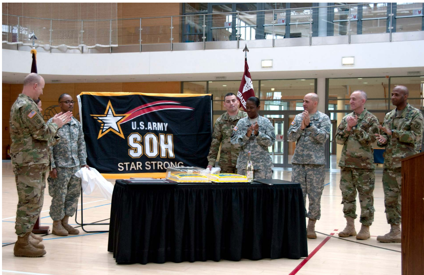
The Wiesbaden Army Health Clinic was recognized Nov. 13, during an Army & Occupational Health Star Site award ceremony, marking the clinic as one of the best in the Army. The award recognizes the clinic for earning the highest level of safety as determined by the judging system.