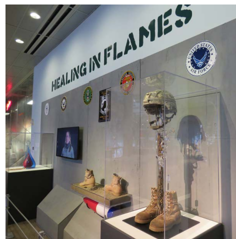
The artists of the Hot Shop Heroes program included a display in their first exhibit embodying their collective war experiences. The exhibit will run through March at the Museum of Glass in Tacoma.

For Bonsall, the whole experience was “powerful in a deep, subtle way.” He’s now