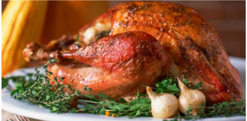
Turkey cooked to an internal temperature of 165 F.

internal temperature. Always use a calibrated metal stem thermometer to check temperatures and measure at the thickest part of the food. Ground meat should look brownish when cooked to 160 F. Poultry can appear light or dark and should be cooked to an internal temperature of 165 F. Fish should look milky and flake easily with a fork when cooked to an internal temperature of 145 F. Cook turkey, stuffing, casseroles and leftovers to 165 F; beef, veal and lamb roasts to 145 F; “fully cooked” ham to 140 F and fresh ham, pork and egg dishes to 160 F. Keep hot foods hot. Cook plant foods to 135 F. Maintain a minimum internal food temperature of 135 F while serving to guests.