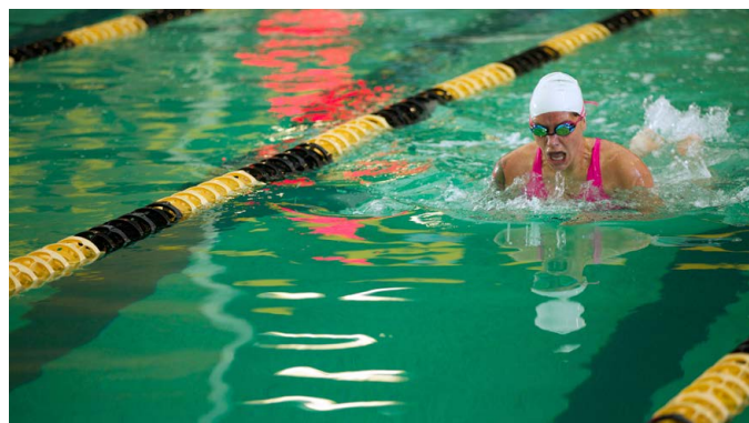
Regional Trials at Fort Bragg, N.C., Nov. 6, 2015. Active duty and retired warrior athletes representing warrior transition units around the Atlantic region competed for a chance to represent the U.S. Army at the Department of Defense Warrior Games in June 2016 at West Point, N.Y.

"(Being a part of this), it's huge," said