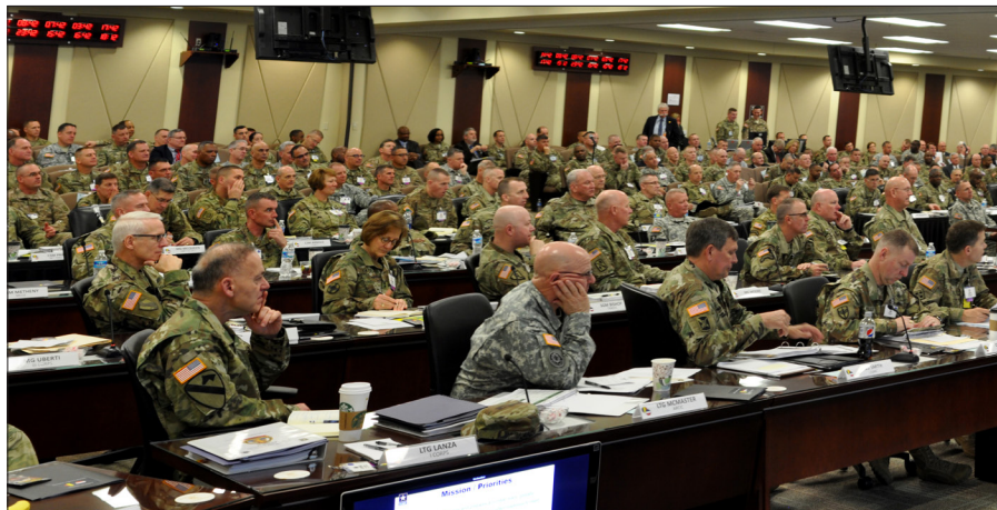
Senior commanders and command sergeants major from U.S. Army Forces Command, U.S. Army Training and Doctrine Command, Army Installation Management Command, the Army National Guard and Army Reserve met March 8, 2016, at Fort Bragg, N.C., for a symposium to collaborate and synchronize key Army initiatives and critical topics affecting Soldiers, Families and the future of the force.