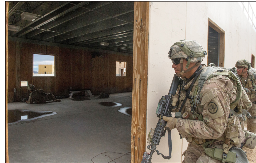
Above Soldiers assigned to 3rd Cavalry Regiment, 1st Cavalry Division, enter a building during a clearance operation on a mock town at the National Training Center, Fort Irwin, Calif., Feb. 18, 2016.