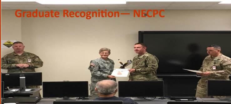
Graduate Recognition — NECPC