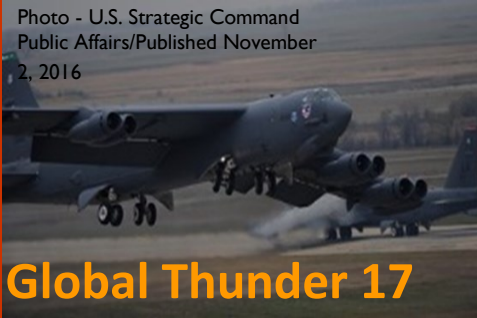
Published November 2, 2016

Read more at: https://www.dvidshub.net/news/193724/arcog-soldier-wins-information-systems-security-associations-annual-volunteer-award