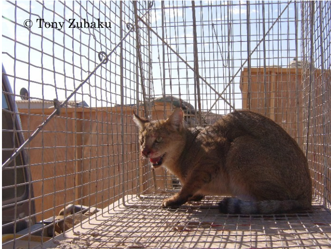
The Jungle cat is a resident of Al Asad, and sometimes approaches

villages or lives in abandoned buildings. In Iraq, they prefer to live among reed beds along rivers or in swampy areas. Rodents, birds, and amphibians make up the diet of the Jungle cat, and near water they will swim for fish. They average 28' long with a short 8-10" tail and weigh 9-35 lbs