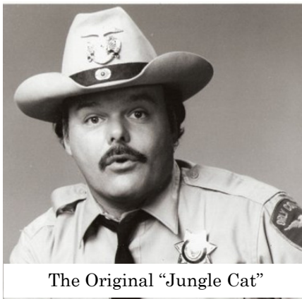
The Original "Jungle Cat"