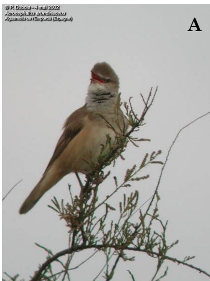
4 May 2002 Acrocephalus arundinaceus #329663

One of the distinctive (some would say noisy) sounds of the Al Asad oasis is the Great Reed warbler (A). It's close cousin, the Basra Reed