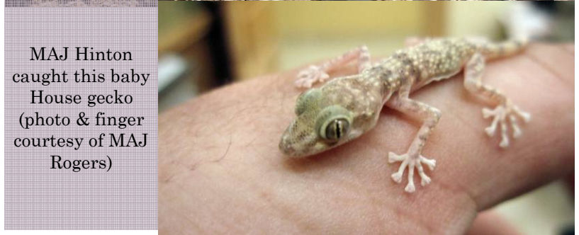
MAJ Hinton caught this baby House gecko (photo & finger courtesy of MAJ Rogers)