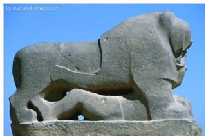
The Lion of Babylon