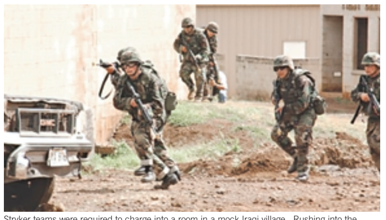
Stryker teams were required to charge into a room in a mock Iragi village. Rushing into the building to secure the room and occupants inside, 5/14th comrades dressed as "Iraqi Insurgents" fired at them

Team leaders were forced to make decisions such as best foot-march routes, foot march pace, rest stops and times, and ammunition