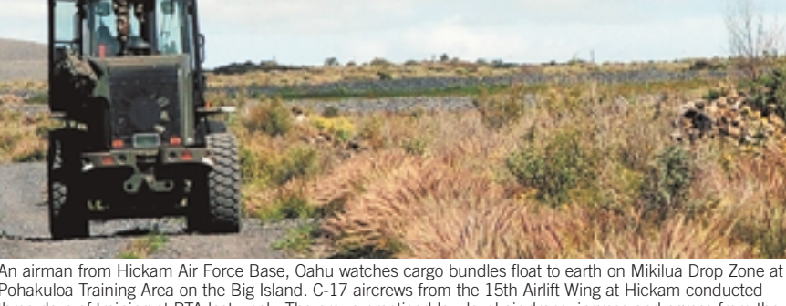
Pohakuloa Training Area on the Big Island. C-17 aircrews from the 15th Airlift Wing at Hickam conducted three days of training at PTA last week. The crews practiced low-level air drops, ingress and egress from the training area

As the last pair of C-17s flew off, Miranda looked out over Mikilua DZand concluded: "From the training point of view, this has been awesome.