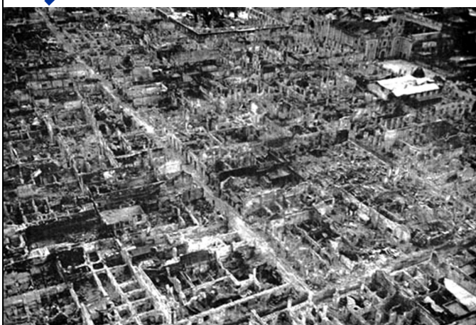
As a result of the battle, Manila was completely destroyed as seen in this photo from mid 1945. Most of the city was razed and then rebuilt after the war.

For answers to trivia, information on this month's artifact spotlight, digital copies of old newsletters and more, visit the ASC History Office website at: