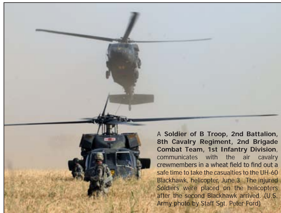
A Soldier of B Troop, 2nd Battalion, 8th Cavalry Regiment, 2nd Brigade Combat Team, 1st Infantry Division, communicates with the air cavalry crewmembers in a wheat field to find out a safe time to take the casualties to the UH-60 Blackhawk, helicopter, June 3. The injured Soldiers were placed on the helicopters after the second Blackhawk arrived.