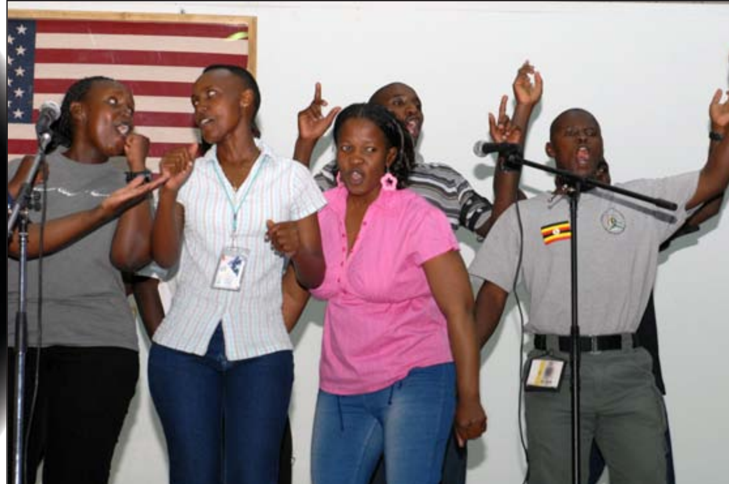
A choir of Ugandan security personnel, raise their voices in praise at a revival at the Camp Liberty Field House, May 30. A different chapel led the revival each night during the five-day event, which culminated May 31, the Global Day of Prayer.