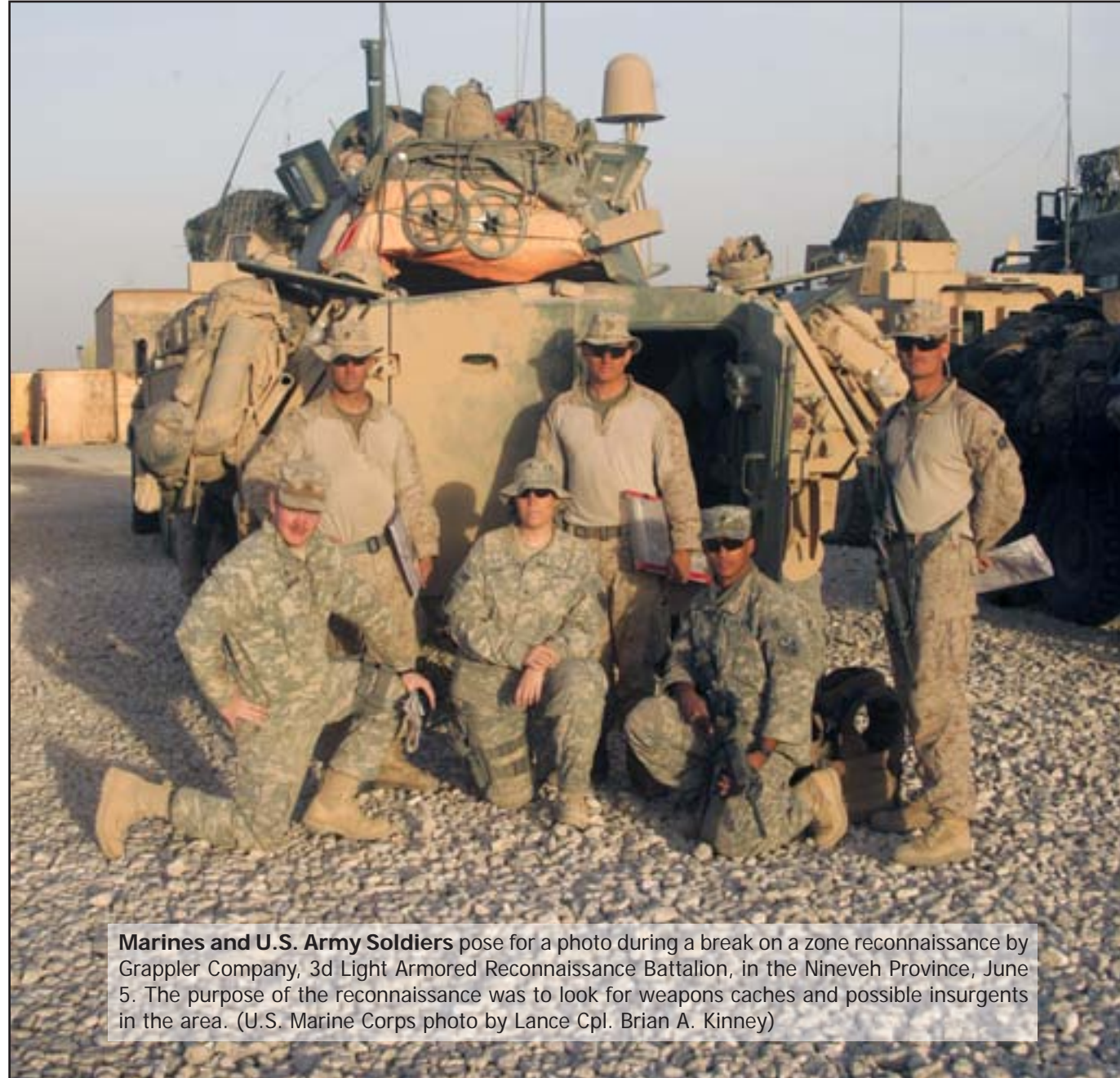
Marines and U.S. Army Soldiers pose for a photo during a break on a zone reconnaissance by Grappler Company, 3d Light Armored Reconnaissance Battalion, in the Nineveh Province, June 5. The purpose of the reconnaissance was to look for weapons caches and possible insurgents in the area.