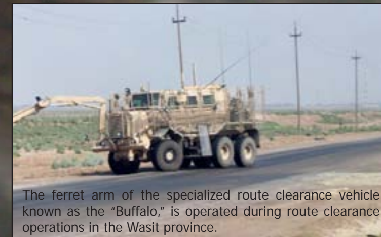
The ferret arm of the specialized route clearance vehicle known as the "Buffalo," is operated during route clearance operations in the Wasit province.

Summing up their mission Hutchinson said, "This deployment has been interesting."