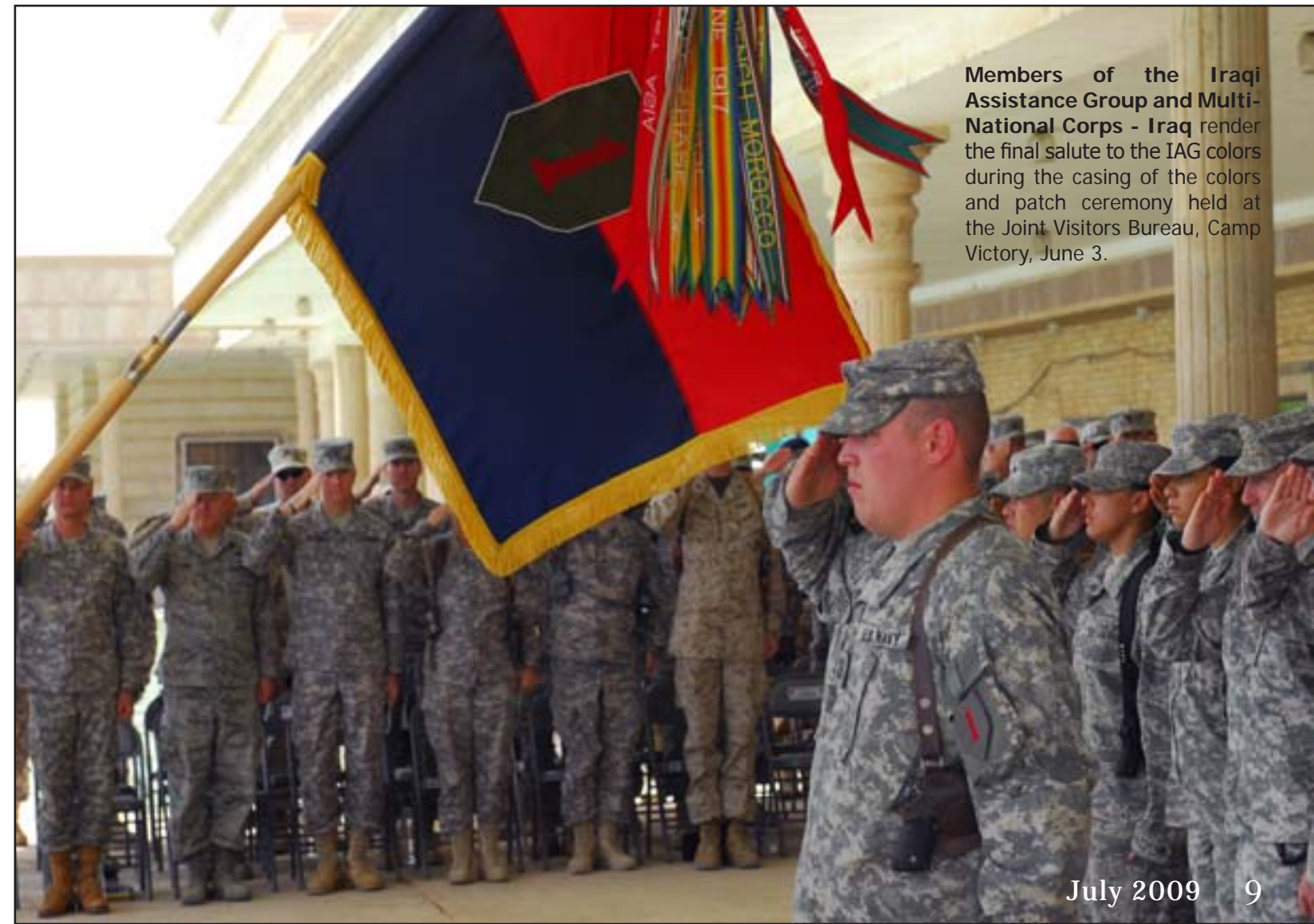
Members of the Iraqi Assistance Group and Multi-National Corps - Iraq render the final salute to the IAG colors during the casing of the colors and patch ceremony held at the Joint Visitors Bureau, Camp Victory, June 3.

"Sir," he said, addressing the MNC-I commanding general, "mission complete, courage."