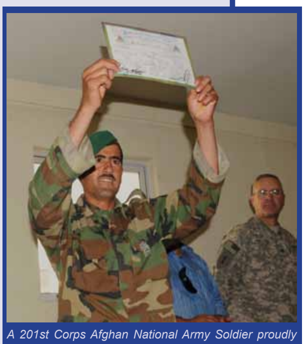
A 201st Corps Afghan National Army Soldier proudly displays his well-earned diploma from the Master Gunners Course, after completing the intensive 14-day training curriculum on various military weapons.

diers on how to properly handle and operate them.