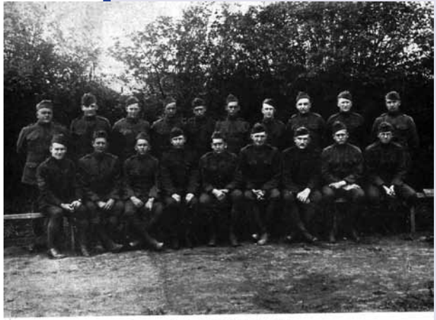
Regimental Non-Commissioned Sta

Two months after the U. S. entry into World War I, Company A was drafted into federal service on June 20th, re-