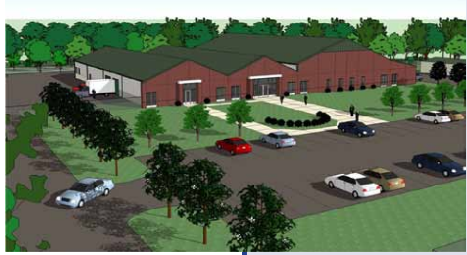
Artist rendering of the new 116th CES facility

When the work is done, the 116th engineers will have a new energy efficient facility. It will boast three training areas for wing personnel to obtain