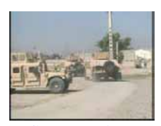
CJTF Phoenix IX Operations

To see videos, click on the name of the story.