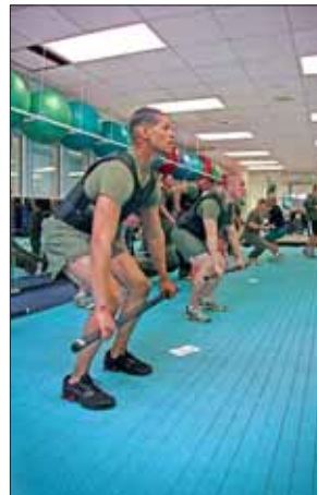
Marines perform squats with a weighted bar during a semper fit class, Feb. 2.