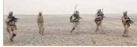
Marines from India Company, 3rd Battalion, 6th Marine Regiment and a Pashto linguist patrol during a sandstorm in Helmand province, Afghanistan, Feb. 8.