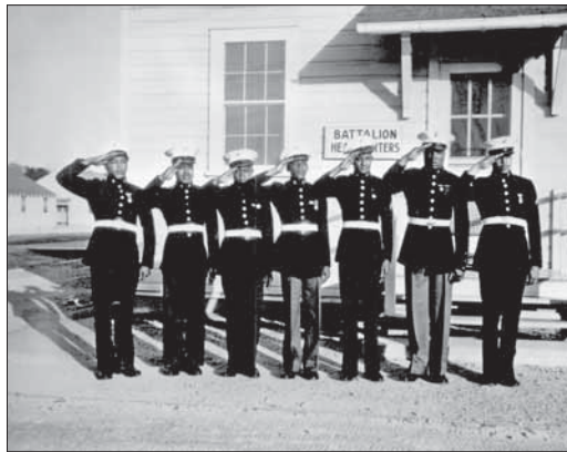
Although a dress uniform was not a part of their regular equipment, most of the African-American Marines spend $54 out of their pay for what is generally considered the snappiest uniform in the armed services.