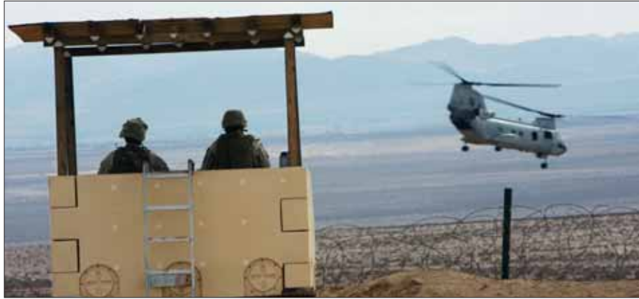
Marines with Company K, 3rd Battalion, 1st Marine Regiment, from Marine Corps Base Camp Pendleton, Calif., watch a CH-46 Sea Knight lift off Feb. 1, at Combat Center Range 220 during their enhanced Mojave Viper predeployment training. The battalion will deploy to Afghanistan this spring to support Operation Enduring Freedom.