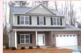
3109 John Willis Rd.

4 BR, 2.5 BA, 2 Story 1,715 sq. ft. This 2-story plan offers plenty of space with 4 bedrooms and spacious great room with fireplace. Open kitchen/dining area, laundry room, owner's suite has bath, walk-in closet, cathedral ceiling. #74290