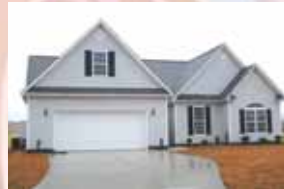
2900 Tina Ct.

3 BR, 2 BA, 1.5 Story 1,812 sq. ft. New quality construction, "The Marsha" Open floor plan, 9' ceilings, roomy master bath with jacuzzi and shower. Large walk-in closet in master bedroom. FROG. Convenient to Cherry Point. #73734