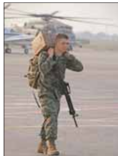
A Marine with the 22nd Marine Expeditionary Unit carries a box of meals-ready-to-eat to a KC-130J Hercules leaving for the Toussaint Louverture International Airport in Port-au-Prince, Haiti, Feb. 6.