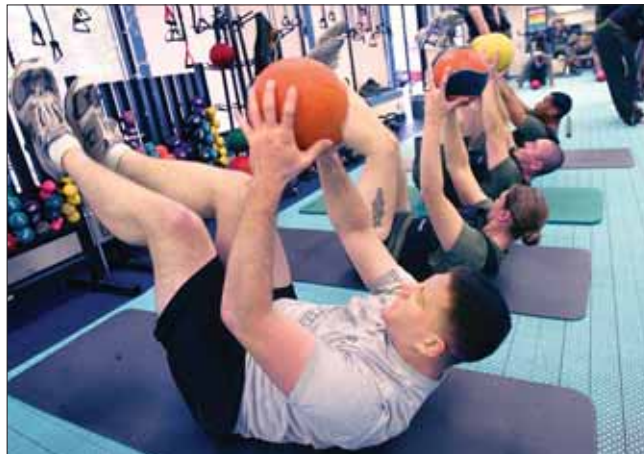
Cherry Point Marines execute abdominal crunches with medicine balls during a semper fit class, Feb. 2.