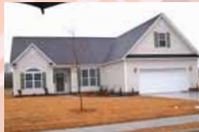
2806 Walter Dr.

3 BR, 2 BA, 1.5 Story 1,904 sq. ft. The Betsy Plan with 9' ceiling, covered back porch, Master bedroom with whirlpool & shower, double vanities, separate dining room, oversize double garage. Natural gas to water heater & logs. FROG. #73901