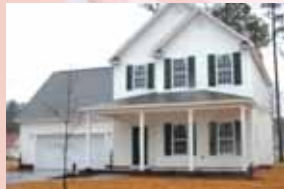
3204 Catarina Ln.

3 BR, 2 BA, 2 Story 1,996 sq. ft. The "Hadley" a beautiful open floor plan, 9' ceilings, master bedroom has double vanities, jacuzzi and shower. Screened rear porch overlooking pond. #752444