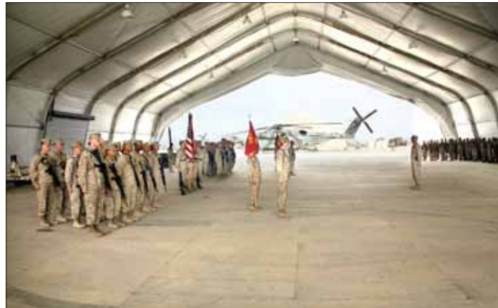
Marines from Marine Heavy Helicopter Squadron 462 and HMH-466, Marine Aircraft Group 40, Marine Expeditionary Brigade-Afghanistan, stand in formation for the transfer of authority ceremony here, Jan. 21.