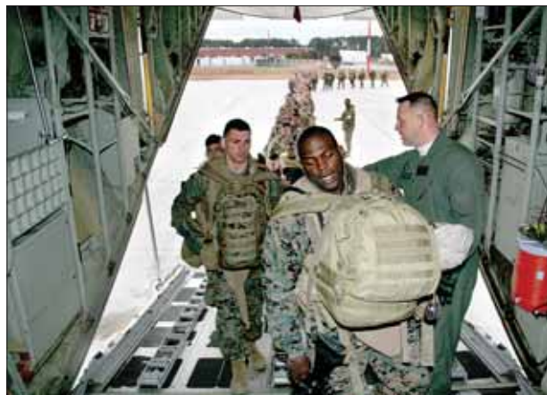
Marines from 2nd Marine Division, 3rd Battalion, 6th Marine Regiment, board a KC-130J Hercules leaving for Port-au-Prince, Haiti, Feb. 6. The leathernecks from 3/6 replaced Marines with the 22nd MEU already engaged in relief operations.