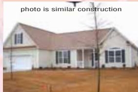
2805 Walter Dr.

3 BR, 2 BA, 1.5 Story 1,915 sq. ft. The "Gary" Plan with 9' ceilings. Open floor plan, separate dining room, big pantry, whirlpool & shower in master bedroom. FROG. #72294