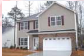
3107 John Willis Rd.

4 BR, 2.5 BA, 2 Story 2,078 sq. ft. Beautiful new home with energy saving features, spacious closets, 9' first floor ceilings, 12x14 concrete patio. Many available options. Plan #1937 "C" jcjackson.com. #72626