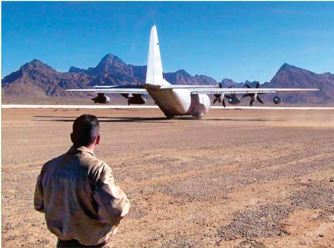
A Marine from Marine Aerial Refueler Transport Squadron 252, Detachment B, looks on as one of the squadron's KC-130J Hercules prepares to take off on an aerial delivery mission in support of Task Force 71 in Afghanistan.