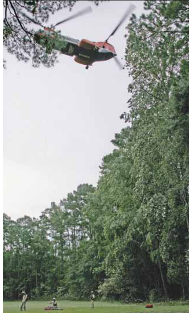
An HH-46D hovers above search and rescue crew members as they prepare to airlift a dummy victim in need of a medical evacuation, Aug. 31, during a training evolution at Cherry Point.