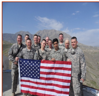
The I-178 FA BN arrived in Afghanistan 26 February 2010.

The first group of seventeen Soldiers arrived on 26 February 2010. The rest of the Battalion arrived in-