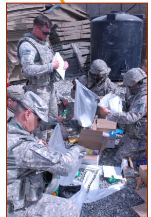
A dismounted patrol assembles gift bags for Afghan kids.

at Camp Phoenix, Kabul AFG. Founded more than four years ago by a former Camp Phoenix Soldier, OO-AFG has a mission of providing humanitarian and medical assistance to the Afghan people living around Camp Phoenix.