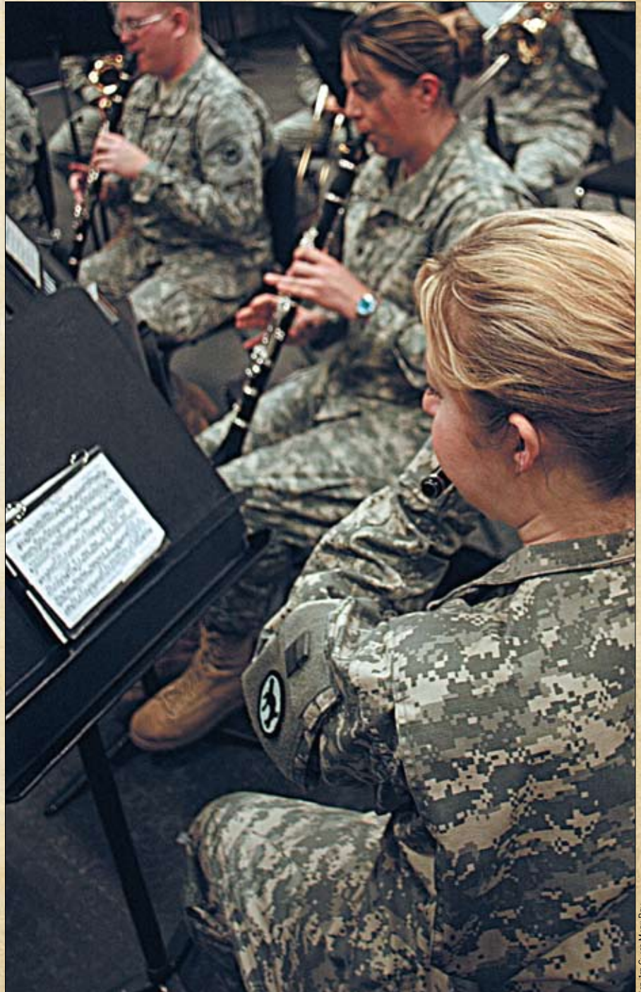
Members of the Army Reserve's 100th Army Band practice ceremonial music.