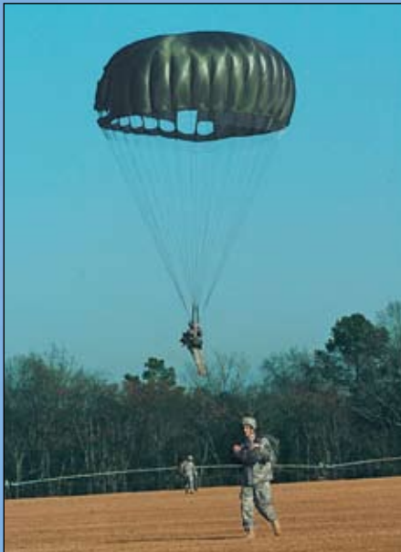
Soldiers from the 421st Quartermaster Company land at a drop zone during their first annual Employer Support of the Guard and Reserve Boss Lift.

FORT VALLEY, Ga. — Army Reserve Soldiers from the 421st Quartermaster Company, 143rd Sustainment Command conducted an airborne jump for a group of civilian employers Jan. 9, 2009 during the unit's first annual Employer Support of the Guard and Reserve Boss Lift project.