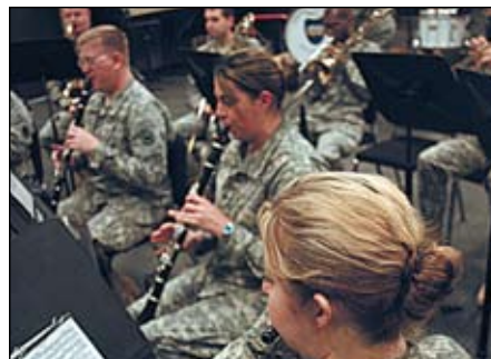
MY ARMY RESERVE LIFE: ARMY RESERVE BAND ROCKS FORT KNOX, SOUTHEAST.....14