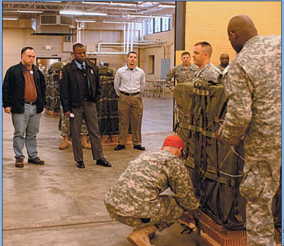
Civilian employers listen as Soldiers from the 421st Quartermaster Company demonstrate how parachutes are attached to containers for drops into combat areas.