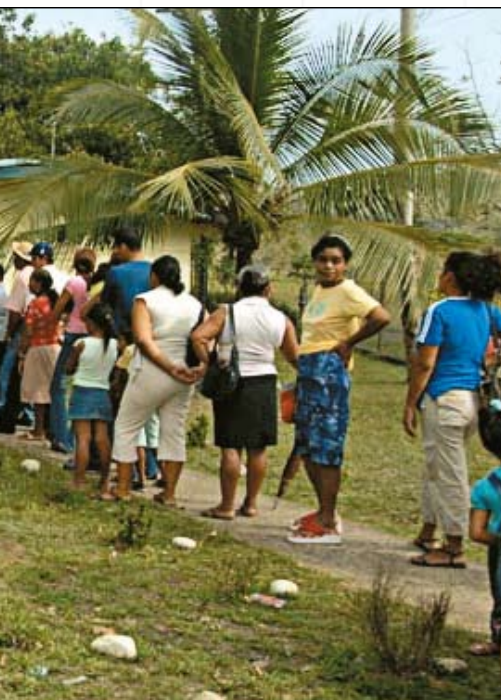
Receive free basic medical care from members of Panama’s Support Unit.