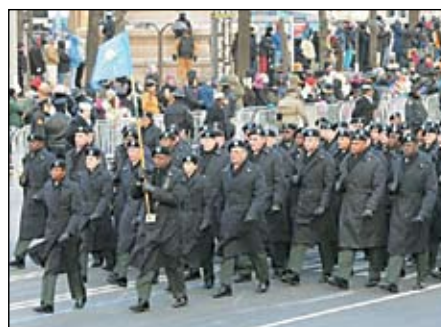
COMMUNITIES: MAKING THE GRAND MARCH.....28