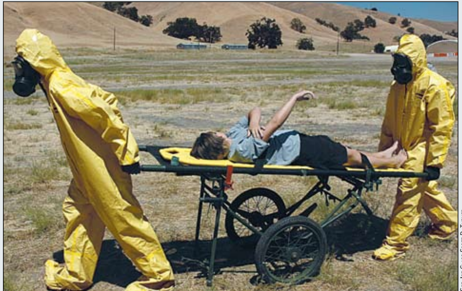
Annual validation exercises engage USAR Soldiers in relevant training.

The Army Reserve devises effective manning strategies that minimize disruption for Soldiers, Families and employers while delivering cohesive