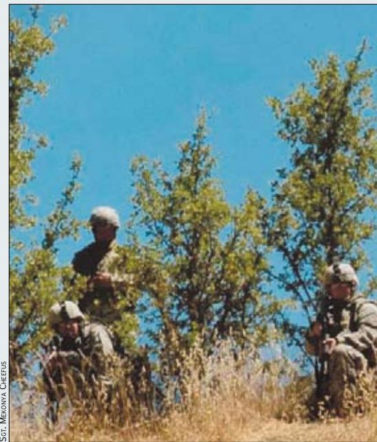
SGT. MEKONYA CHEPUS

To help meet this challenge, we have launched a unique employer program