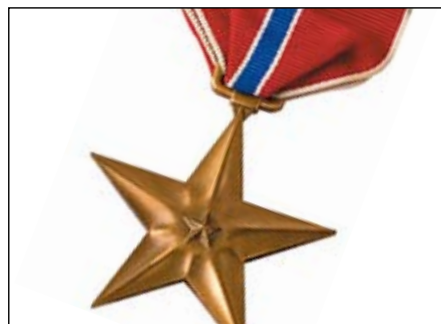
THE YEAR OF THE NCO: ARMY RESERVE SOLDIER EARNS BRONZE STAR FOR VALOR IN IRAQ...22