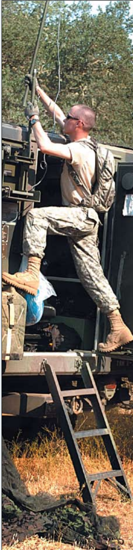
The Army Reserve provides trained and ready Soldiers to combatant commanders.