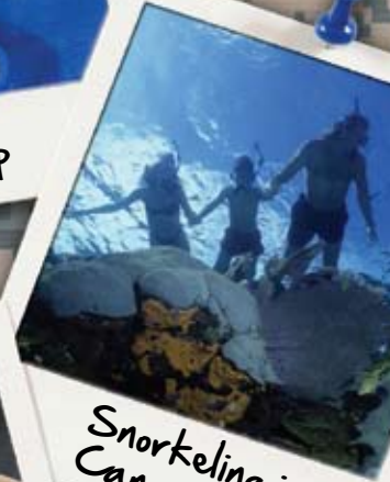
Snorkeling in Cancun