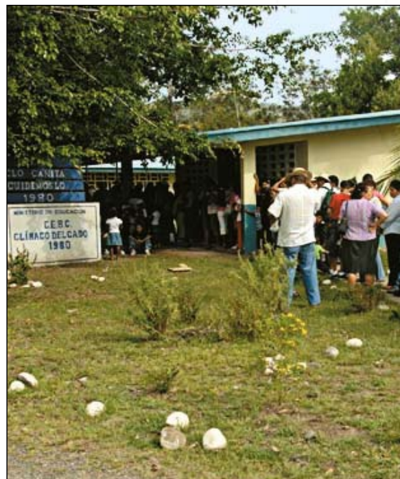
Villagers line up at the Climaco School in Canitas, Panama to receive dental services from the Ministry of Public Health and the U.S. Army's 7218th Medical Support Unit.

underwent an oral examination. The dental area, equipped with two reclining chairs and tables laden with sterile dental tools, gauze pads and injection needles, was without a doubt the least favorite